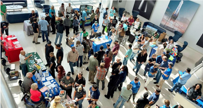
Overhead view of environmental organizations and Blue Origin employees on Earth Day.

Nine environmental organizations connected directly with over 500 Blue Origin employees at Kennedy Space Center on April 22, 2026, for Earth Day celebrations. EEL Central Region Naturalist Rob Lane represented both Sams House and the Environmentally Endangered Lands Program for Blue Origin’s Earth Day Celebration. (Rob is at top left table in photo above). Blue Origin marked the occasion with activities, a lunch and learn with Save Our Indian River Lagoon, and an Earth Day vendor fair.