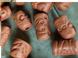
(Below) Clay Beads debossed with Native American art.