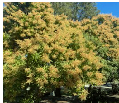
Mango trees in full bloom.

We are sad to report that due to unprecedented freezes in February that killed all the mango blossoms and very likely most of the thousands of trees on Merritt Island, there can be no mango festival this year at Sams House. Temperatures dropped in the 20s for two days in a row killing most tropical trees and plants including palms and mangos. Photos to right show mango trees in full bloom in December, then same trees with frozen blooms and brown leaves in February. :-)