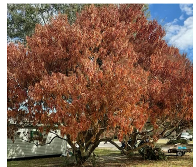
Same Mango trees after the freezes.