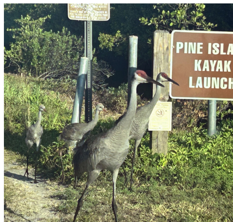
Sandhill Crane chicks, May 4, 2024