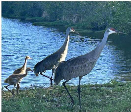
Sandhill Crane chicks, April 13, 2024