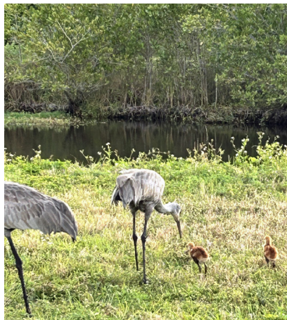
Sandhill Crane chicks, March 23, 2024

This spring at the 900-acre Pine Island Conservation Area (PICA), EEL staff have had the opportunity to watch two sandhill crane chicks grow from downy orange balls of fluff into long-legged colts. Growing as much as an inch per day, sandhill crane chicks reach their adult size within 3 months. Here are pictures taken of this family of four by naturalist Shannon Steele at 3-week intervals from March through May, 2024.