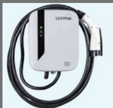
E V Chargers