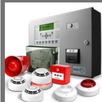
Fire Alarm System