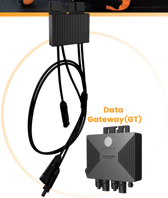
Data Gateway (GT)

www.sungoess.com E-mail: sales@sungoess.com