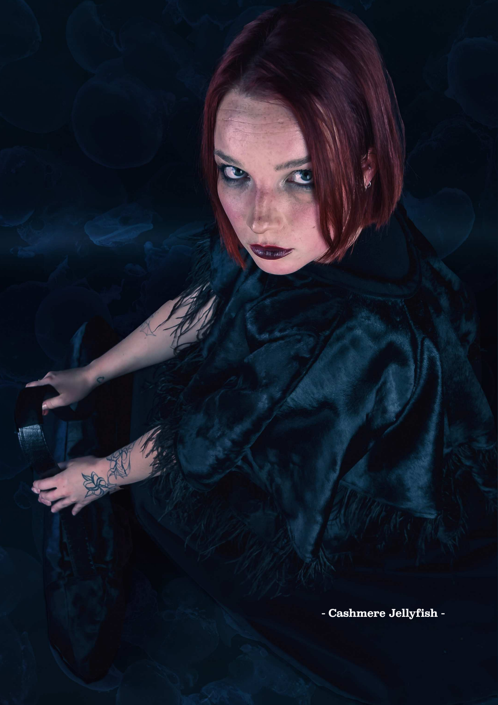
- Cashmere Jellyfish -