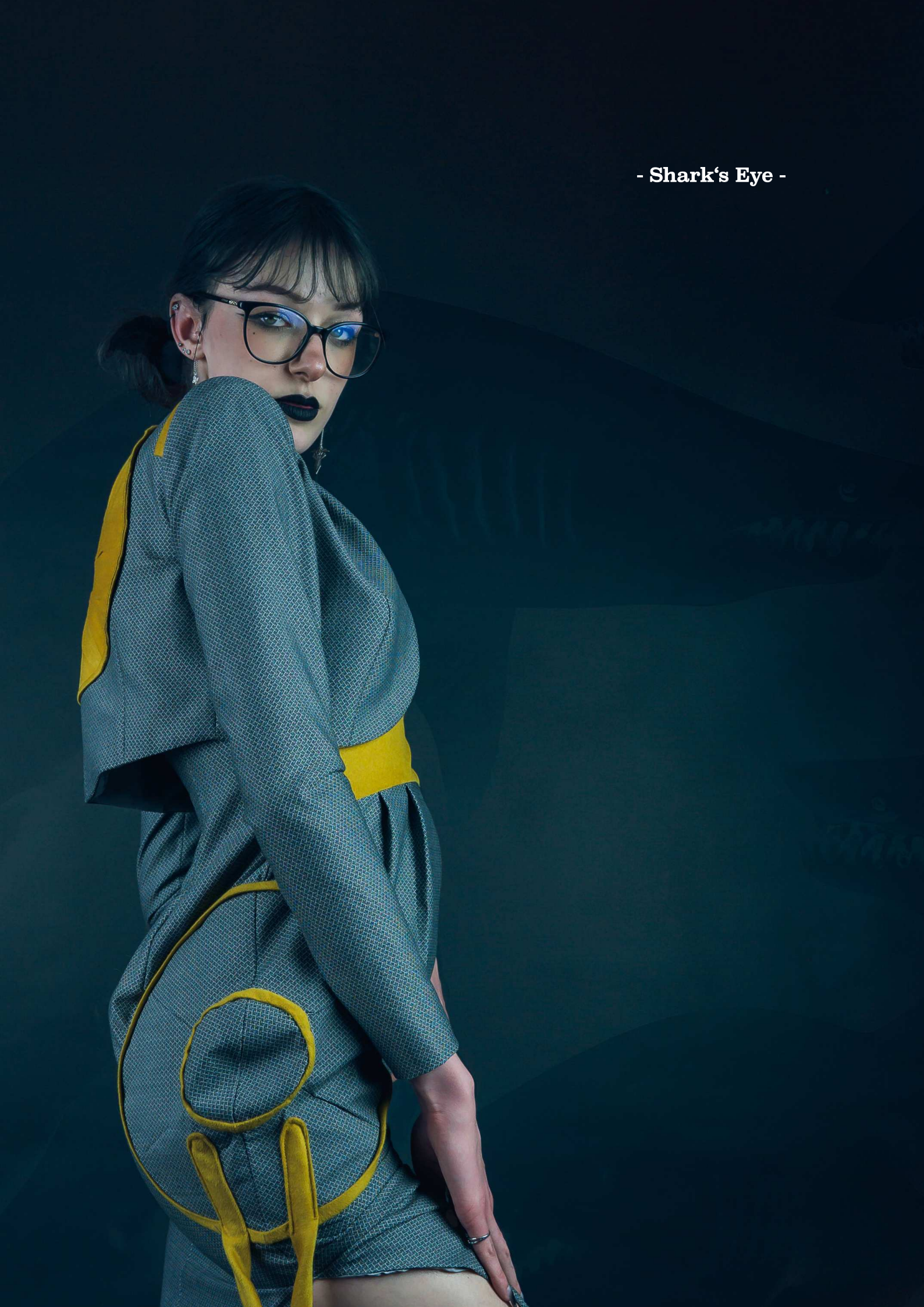
- Shark's Eye -