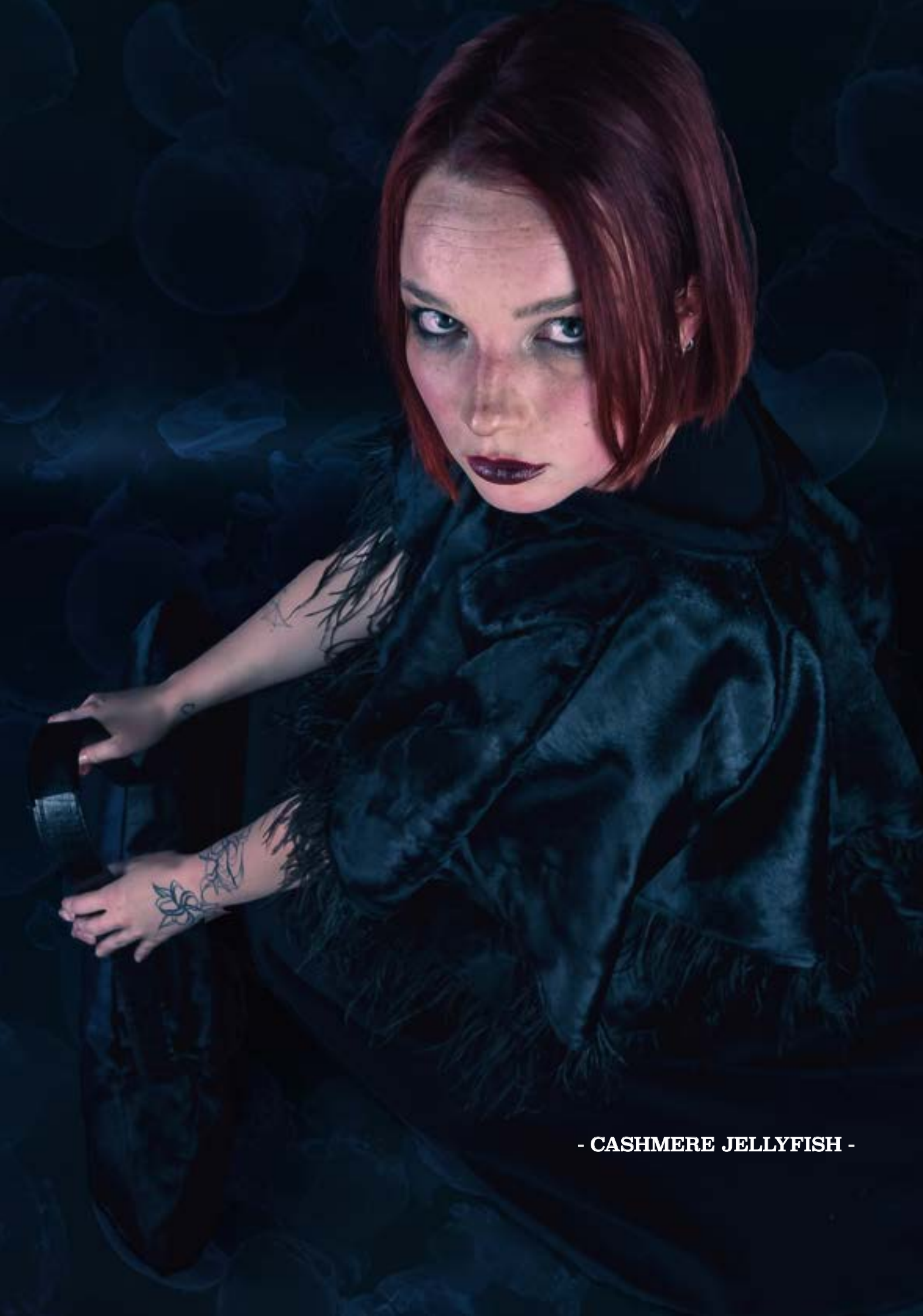
- CASHMERE JELLYFISH -