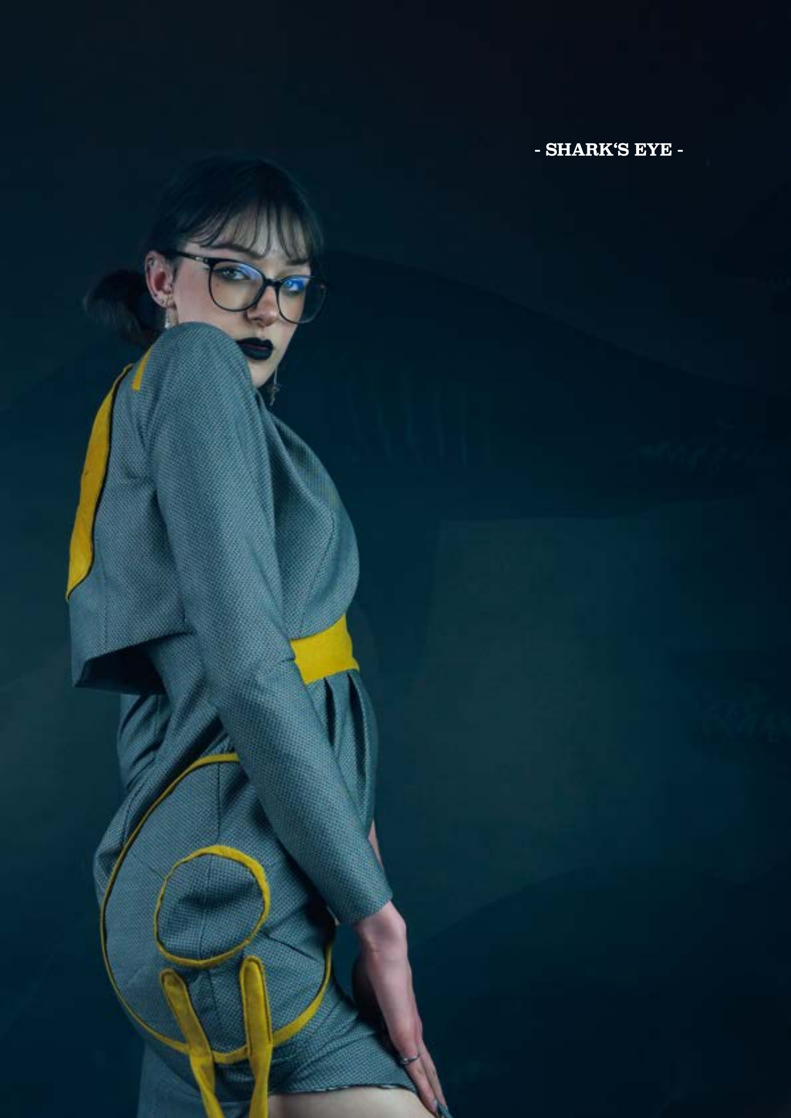
- SHARK'S EYE -