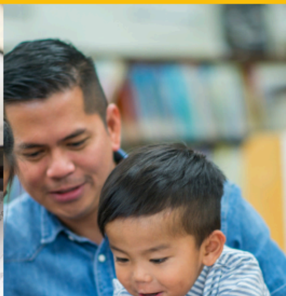
Children's story book