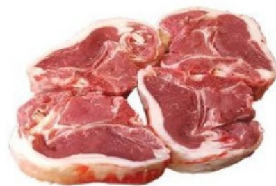
Lamb Neck Chops