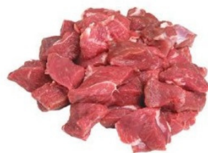
Lamb / Mutton Diced