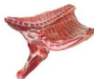
Lamb F/Q Shoulder