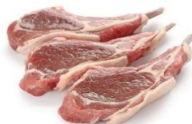
Lamb Front Chops