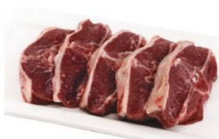
Lamb Back Chops