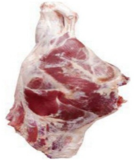
Beef Leg Hind Quarter