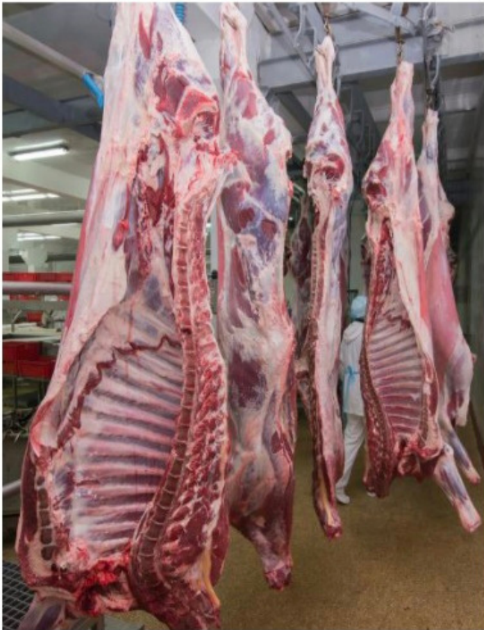
Beef Carcass (Beef whole)