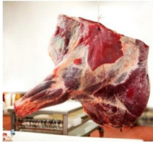
Beef Quarter Shoulder