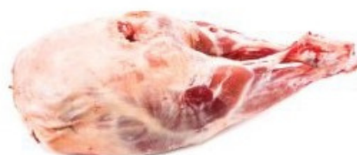
Lamb Double Legs