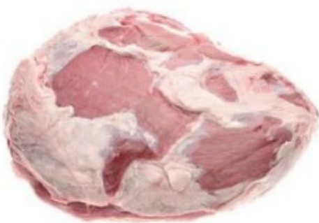
Beef topside cushion