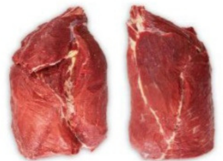
Beef Silverside Pad