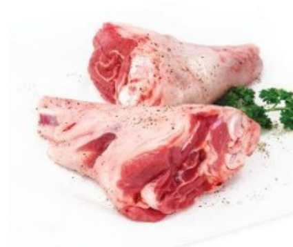
Lamb F/Q Shank