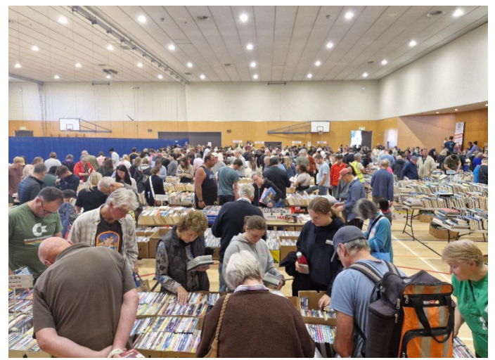
Keen readers looking for their favourite authors

This major fundraising project is a huge, but very satisfying, undertaking for the club.