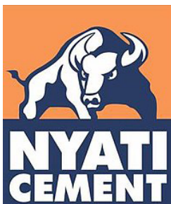
NYATI CEMENT HARAKA HUDUMU ZAIDI