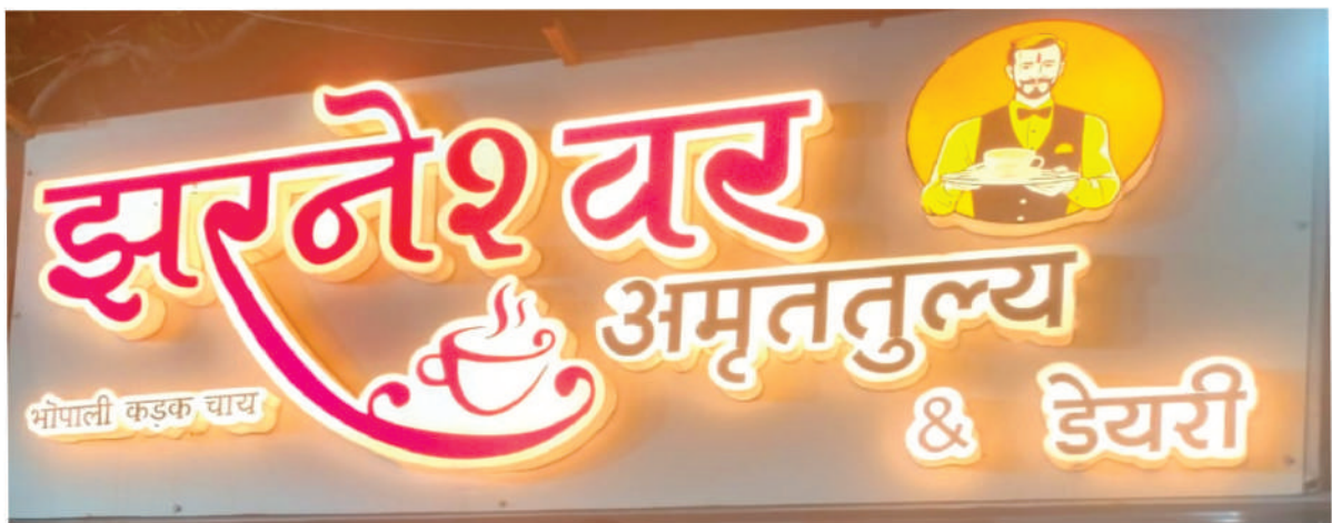
ACP Signboard (96" x 36")