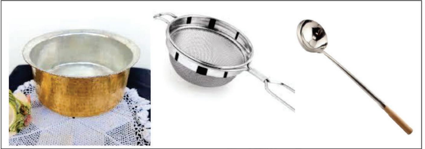
6.Brass Vessels (bartan)& Stirrer