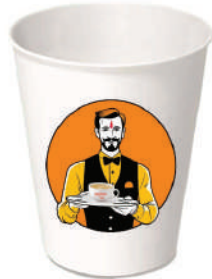
Jharneshwar Paper cups

Details See Jharneshwar Amrutatulya's About Info