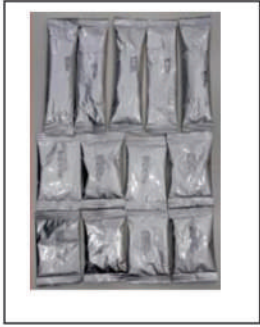
11. flavor Tea