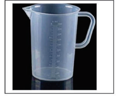
13. Measuring plastic Mu