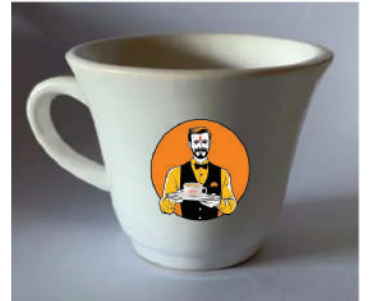
Ceramic Cup Without Print & With Print