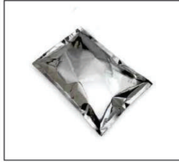
12. Mantra ji gud ki chai