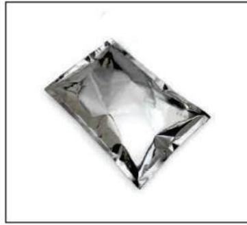
12. Mantra ji gud ki chai