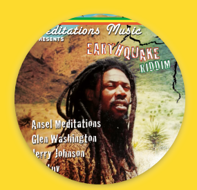
EARTHQUAKE RIDDIM EP