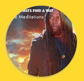
JAH ALWAYS FIND A WAY