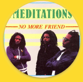
NO MORE FRIENDS