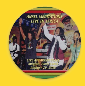
ANSEL MEDITATIONS LIVE IN AFRICA