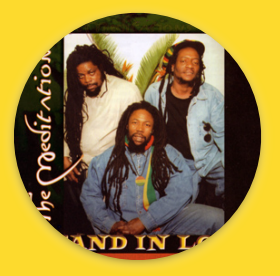
STAND IN LOVE