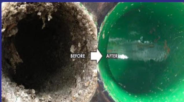
STRUVITE CRYSTAL SCALE