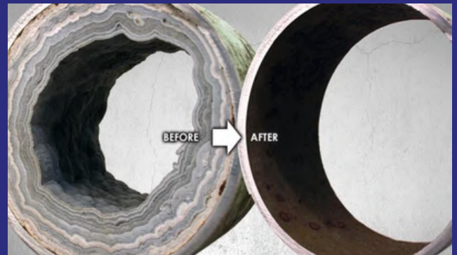
FLY ASH SCALE