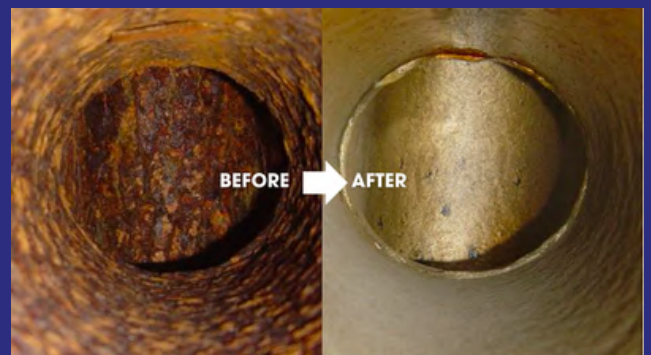
HEAVILY SCALED PIPE