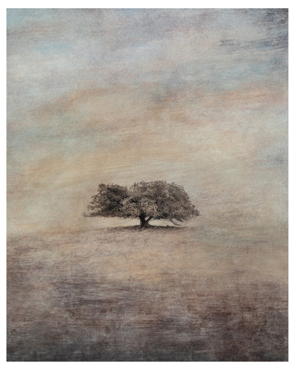
Ink, oil and acrylic on canvas | 155 x120cm | Edition [3]

The majesty and ethereal quality of this magnificent tree serves as a symbol of personal strength and endurance, inspiring us to draw inspiration from nature and find strength within ourselves. The tree's ability to weather the elements is a reminder that we too can overcome the challenges we face in life with resilience and fortitude.