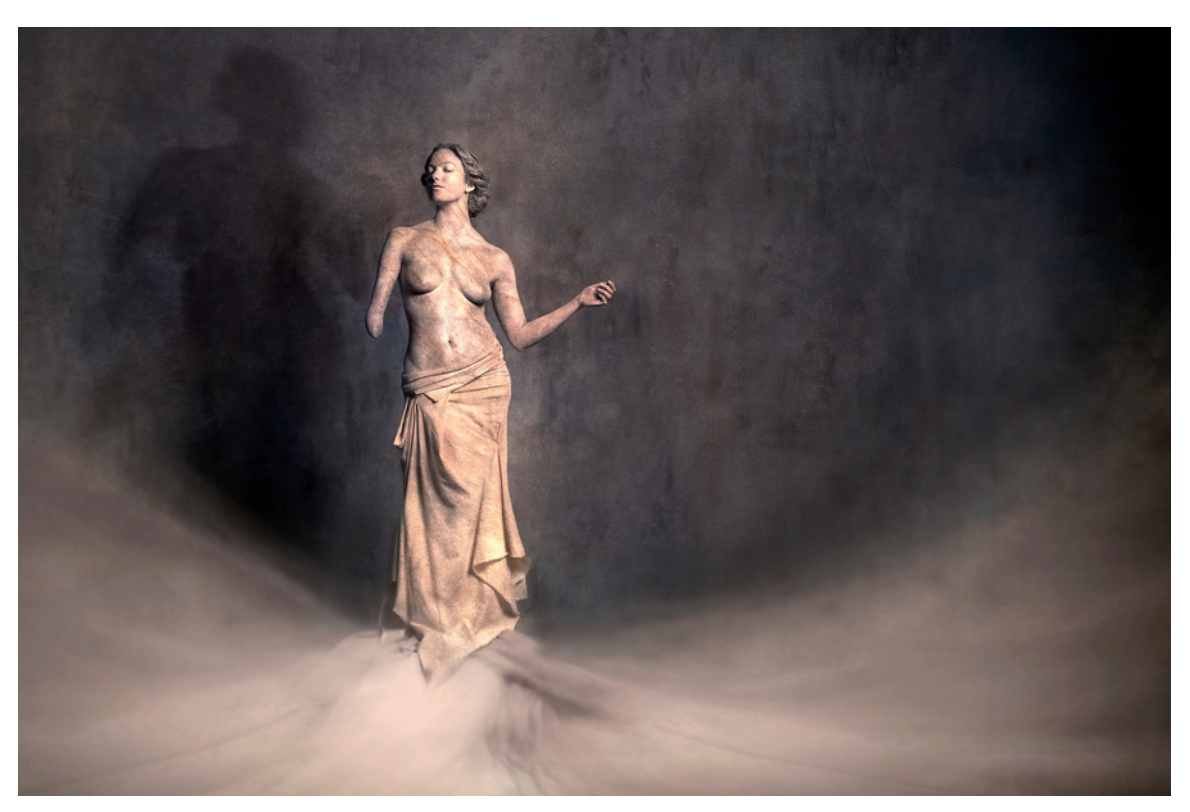
Giclée print on fine art paper | 155x110cm | Edition [5]