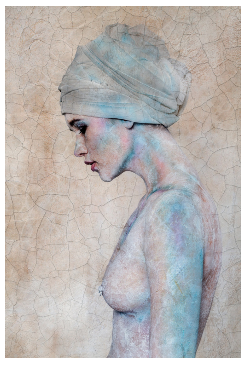
Giclée print on fine art paper | 155x110cm | Edition [5]

An ethereal portrait where, mosaics and arabesque patterns blend harmoniously, creating a bewitching effect. Amidst its poetic and spiritual aura, the struggles of accepting femininity are highlighted. Grace, elegance, and sensuality are intertwined, evoking nostalgia in its timeless aesthetic. This is a mesmerizing masterpiece that captures the essence of beauty and femininity.