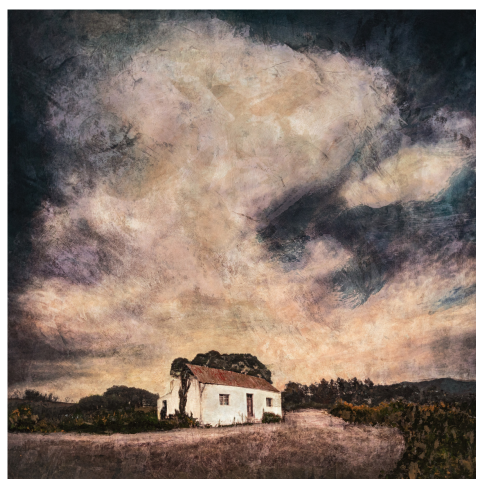
1/1 | Acrylic and ink on metal | 120x150cm