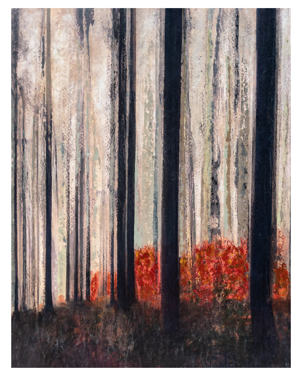
1/1 | Acrylic and ink on metal | 120x150cm

The rustling of leaves, a gentle breeze, A moment of tranquillity, a moment to seize. The forest holds secrets, so ancient and old, A tale of the past, forever to be told.