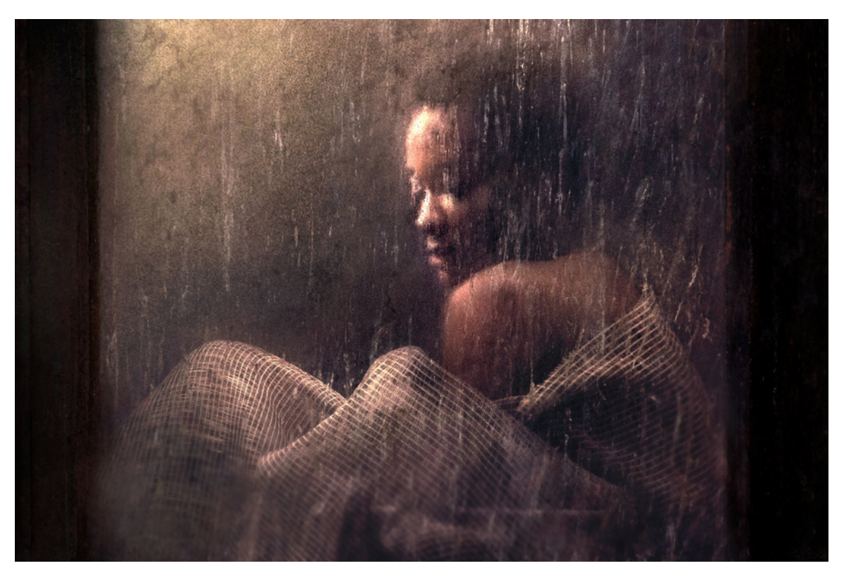
Giclée print on fine art paper | 155x110cm | Edition [5]