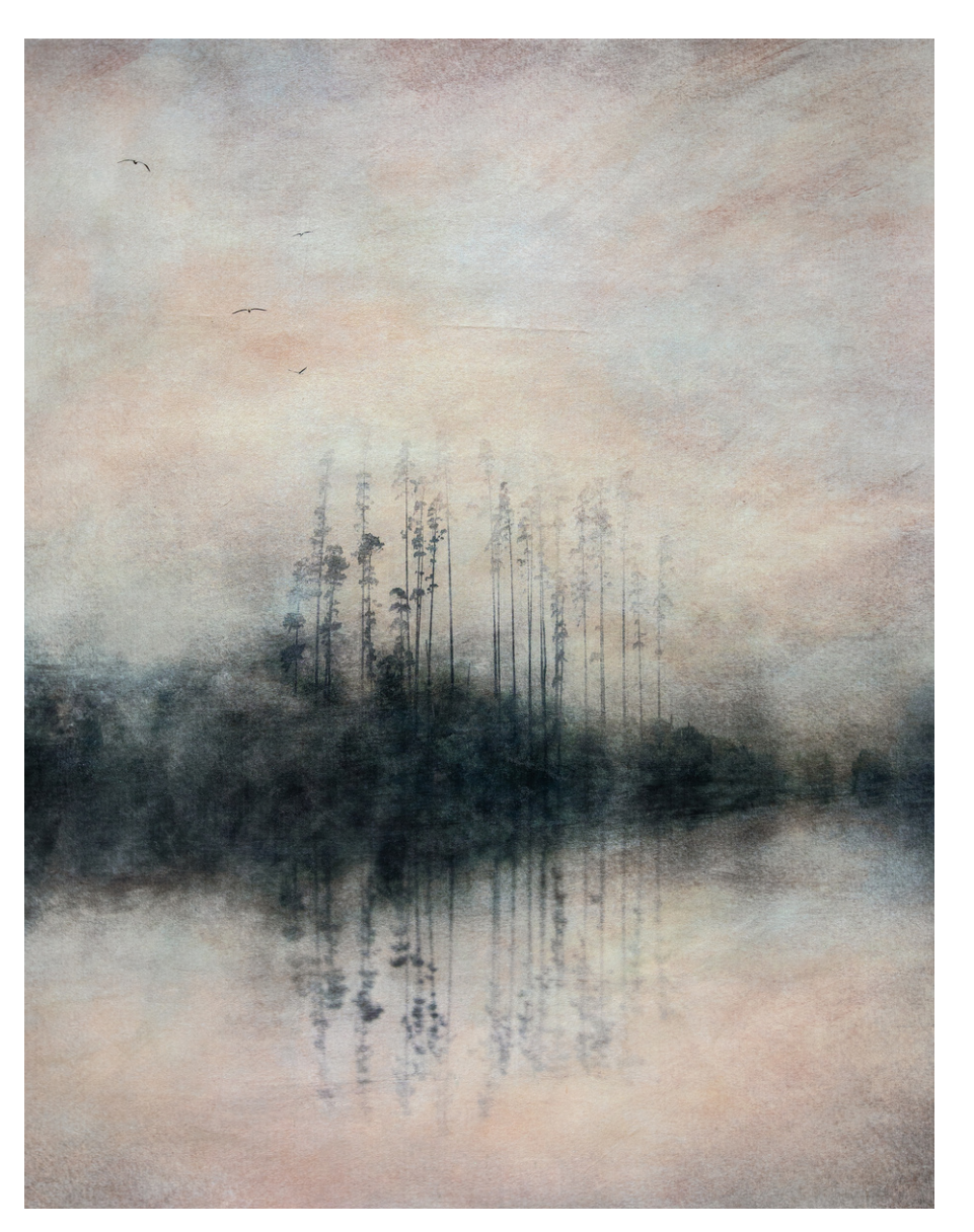
Ink, oil and acrylic on canvas | 155 x120cm | Edition [3]