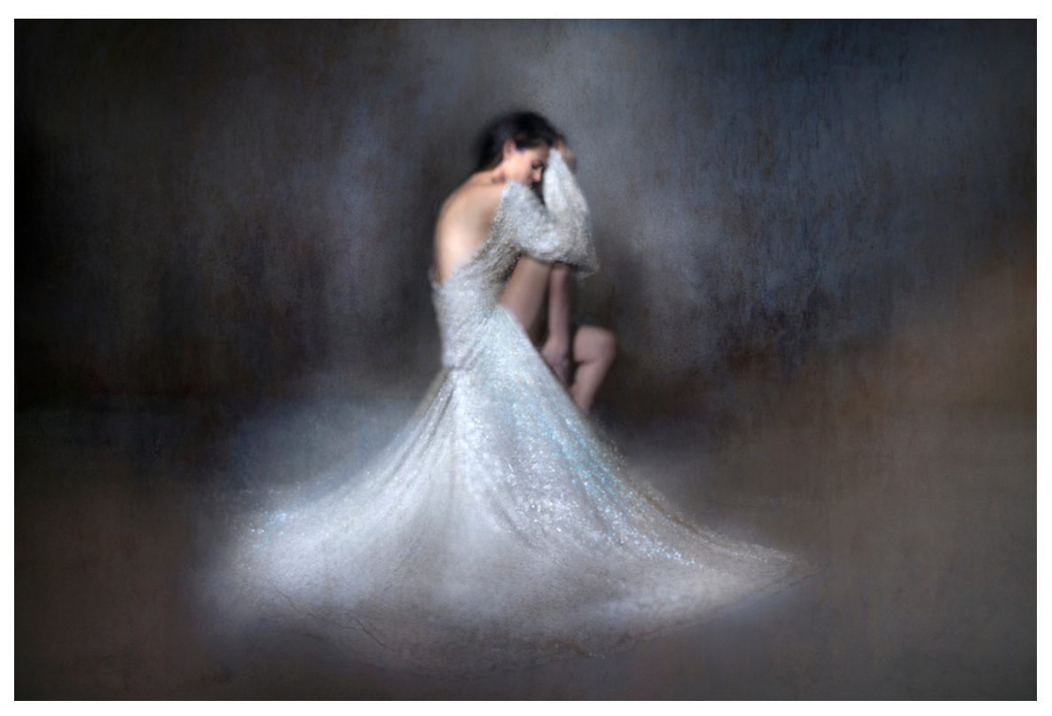
Giclée print on fine art paper | 155x110cm | Edition [5]