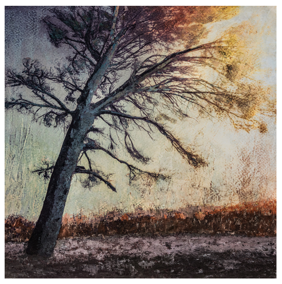
1/1 | Acrylic and ink on metal | 120x150cm