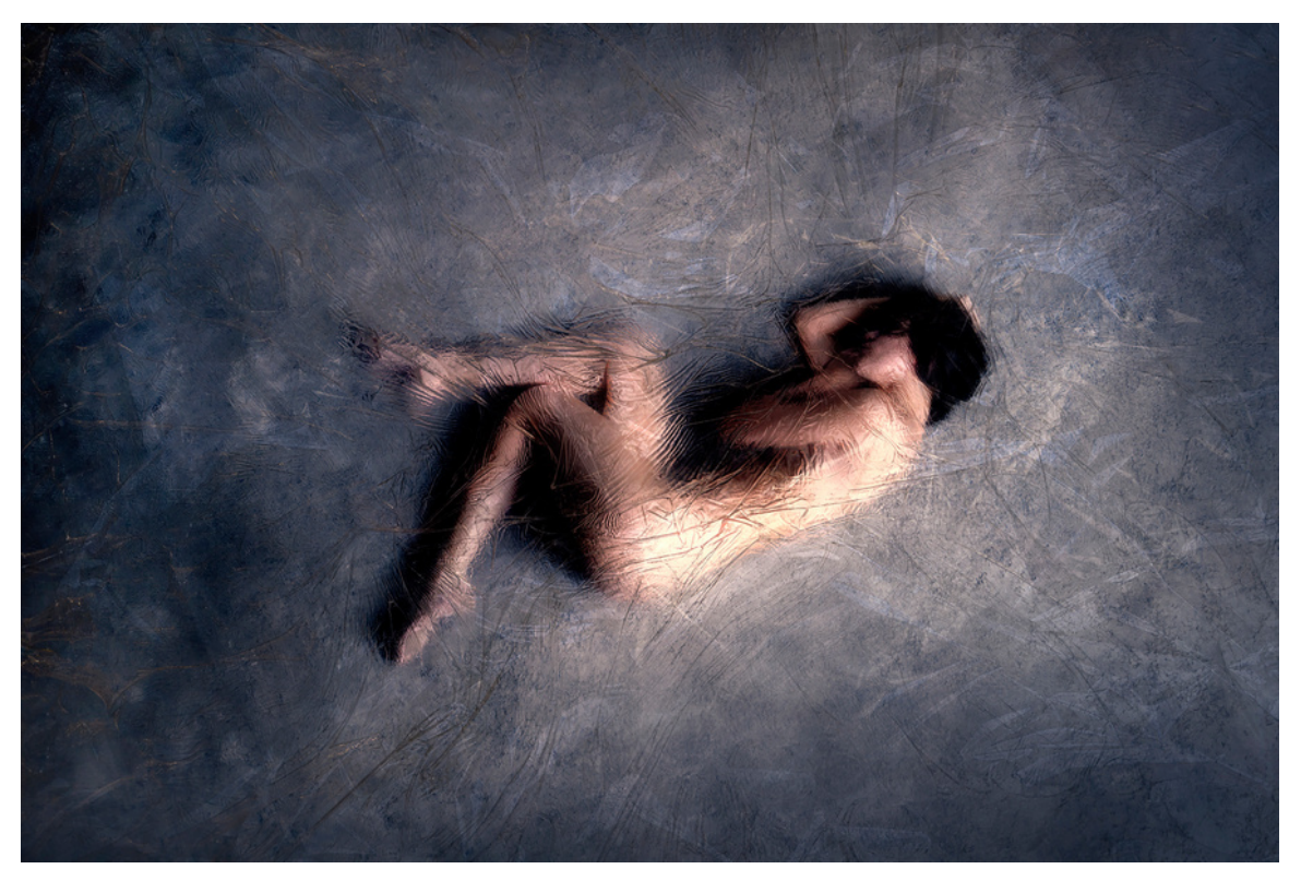
Giclée print on fine art paper | 155x110cm | Edition [5]