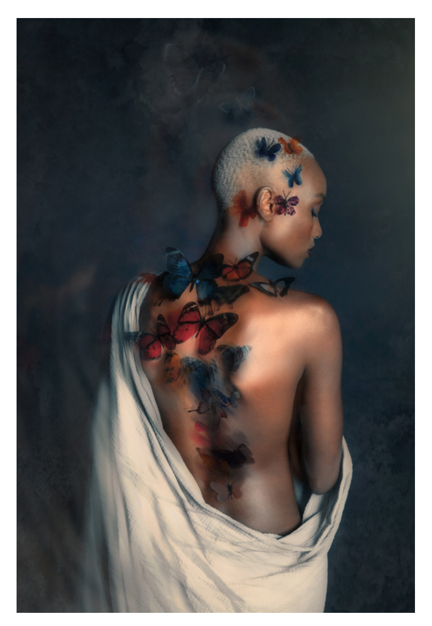
Giclée print on fine art paper | 155x110cm | Edition [5]