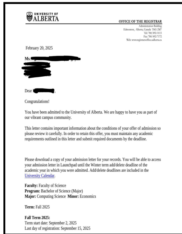
Copy of University Admission Letter