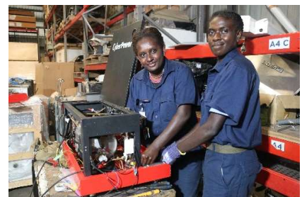
Students Participating in On-the-Job Training