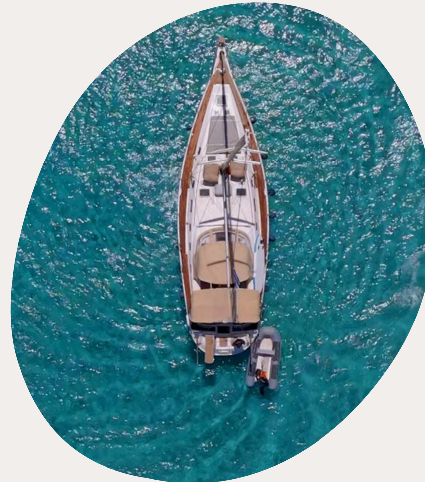
Ocean Star 51.2ft Sailing Yacht