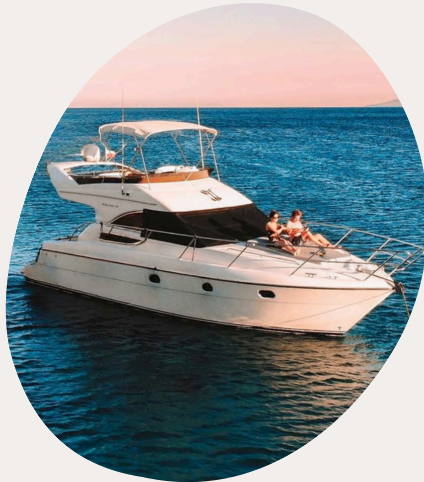
Princess 40ft Motor Yacht