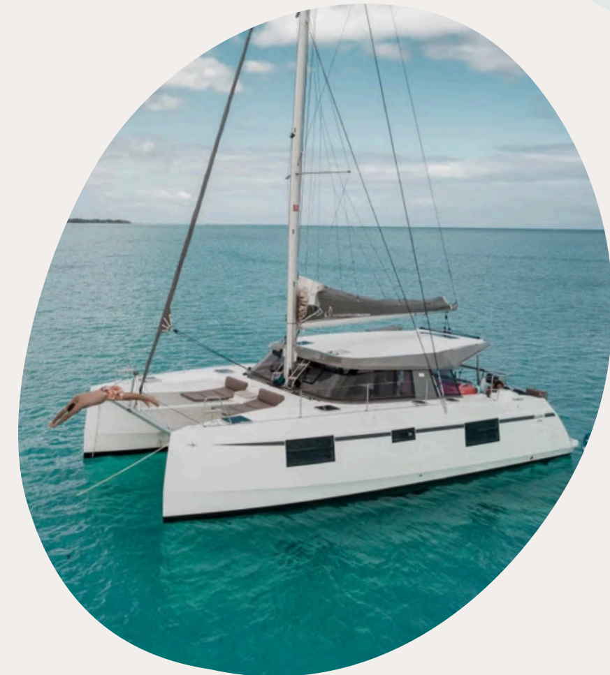
Nautitech 40ft. Catamaran