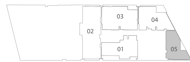
EIGHTH FLOOR PLAN

DISCLAIMER: All measurements, dimensions, coordinates and drawings, given as the Floor Plans in the literature are approximate and provided only for the purpose of marketing, illustration, information and general guidance as such drawings are not to scale. All the rooms, sizes, locations, orientations, dimensions, fixtures, fittings, finishes and specifications (including materials for, placement, size of rooms, windows, doors, balcony, furniture's inbuilt wardrobe etc.) provided in the floor plans may vary as the same have been taken from concept designs prior the actual development/construction and therefore their accuracy in relation to actual construction cannot be confirmed. Hence, we make no guarantee, warranty or representation as to the accuracy and completeness of the floor plan information as changes may be made during the development process, without notice. Always refer to latest IFC design available in the sales office for the most accurate representation of all construction details.