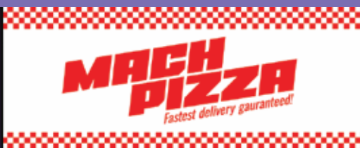
Split ad space (7m x 1.5m)