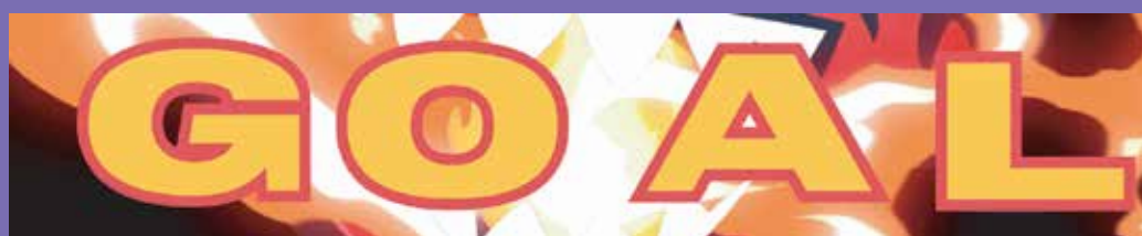
Full-screen advertising (7m x 1.5m)