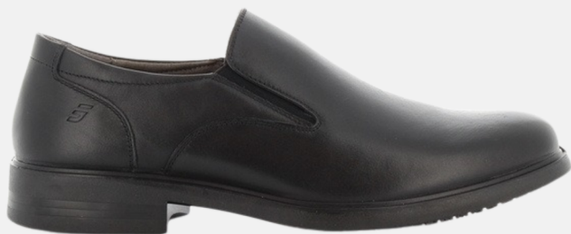
Dublin RM 310.00