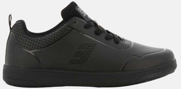
Elis Black Rm 190.00