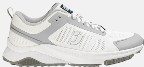
Jumaidi RM 230.00