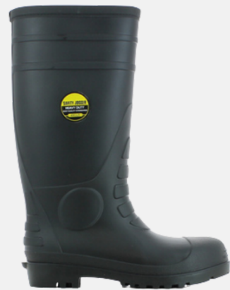
Hercules Rm 120.00