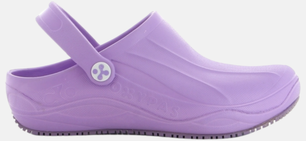
Smooth Rm 145.00