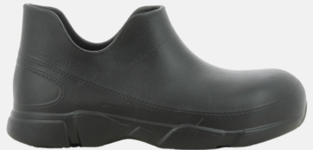
Safety Clog Rm 175.00