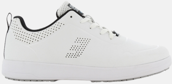
Elis White m 190.00