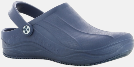
Smooth Rm 145.00