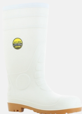
Poseidon Rm 95.00