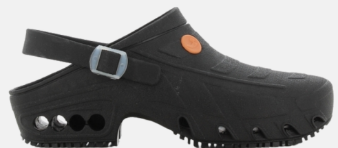
Oxylog RM 188.00