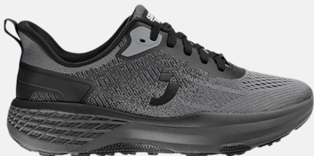
Atum RM 210.00