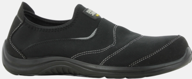
Smooth Rm 158.00