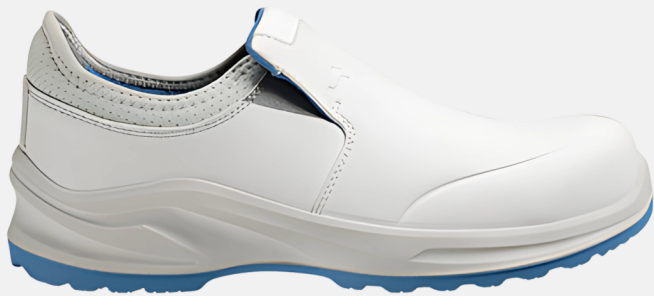
Modulo Pure RM 330.00