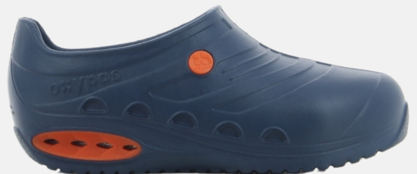
Oxysafe Rm 210.00