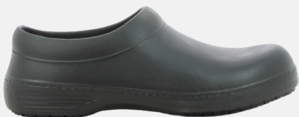
Bestclog Rm 135.00