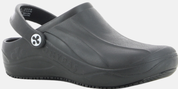
Smooth Rm 145.00