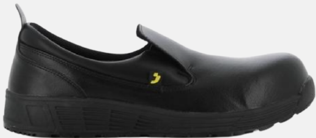
Tana Rm 190.00