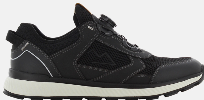
Colors do RM 330.00