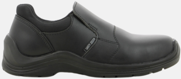
Dolce Rm 205.00