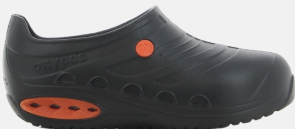
Oxysafe Rm 210.00