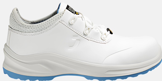
Modulo lace RM 290.00