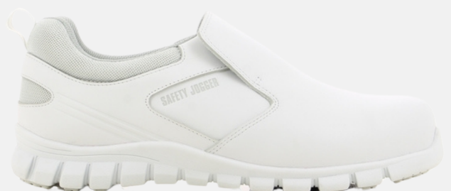
Gusto 81 Rm 400.00