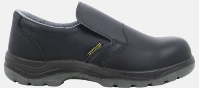
Dolce 81 Rm 258.00