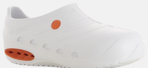
Oxysafe RM 210.00