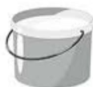
Wallpaper paste or Wallpaper glue