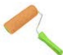
Roller or Brush