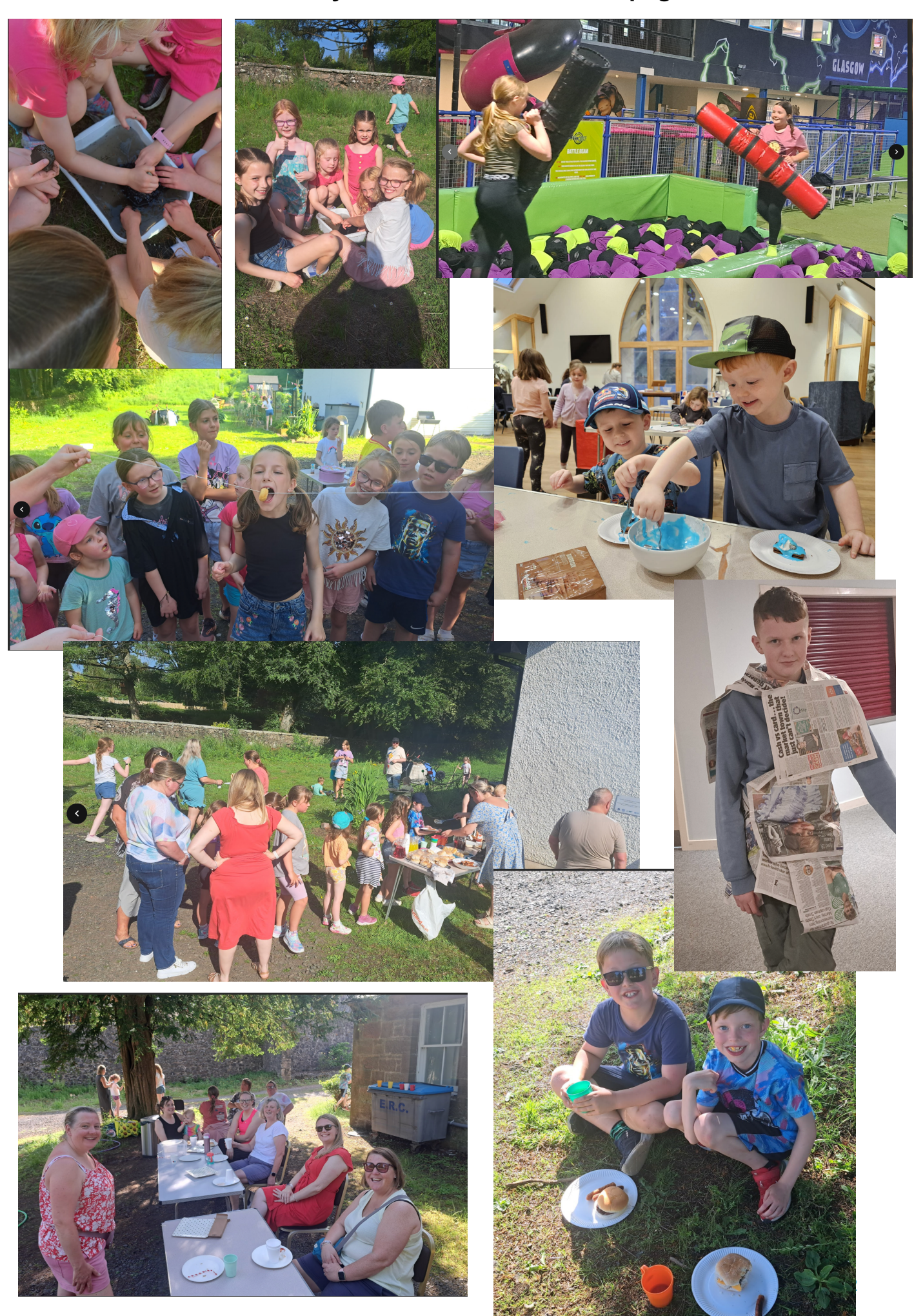
Fun at Messy Church and EPYC...see page 9