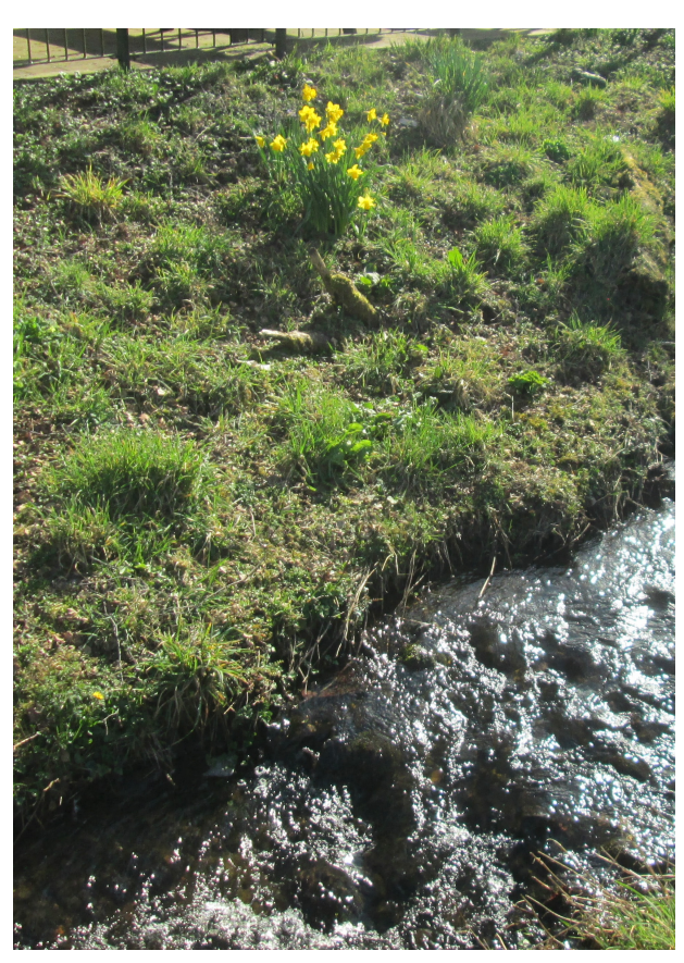
A time of renewal - new life around Eaglesham in Spring