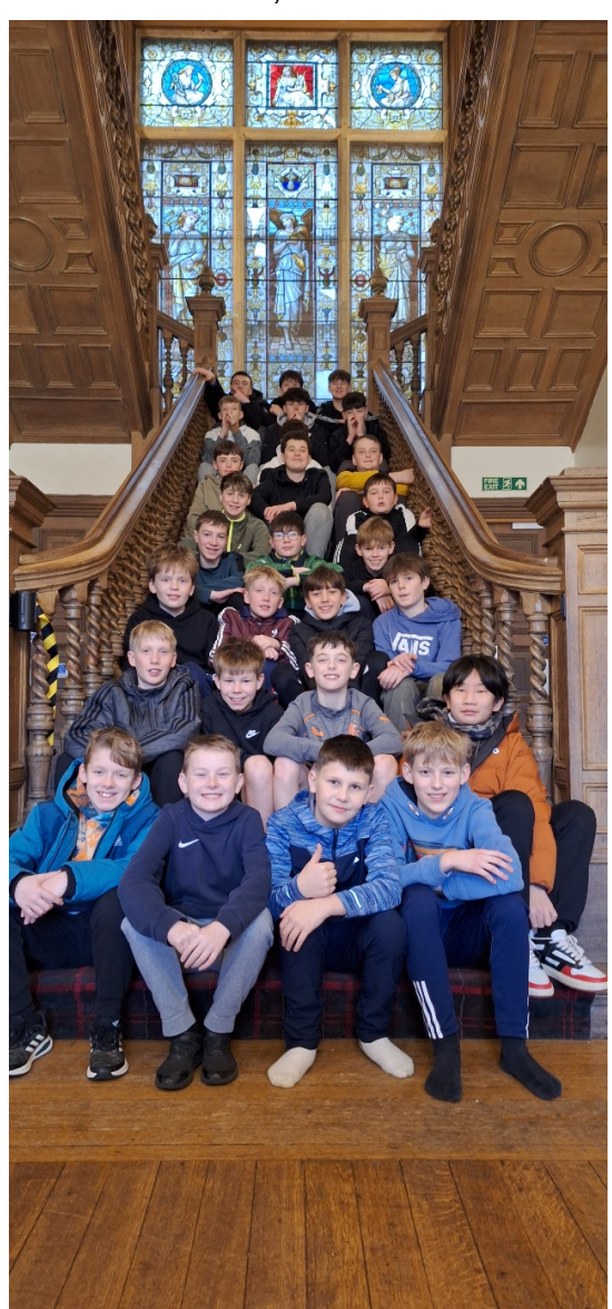
The team on Lendrick Muir staircase