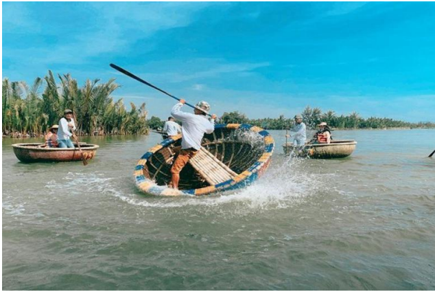
Cam Thanh Water Coconut Village (Hoi An)