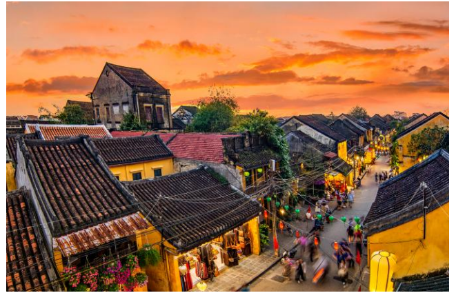
Hoi An Ancient town