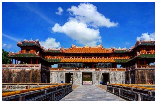
Imperial City (Hue)