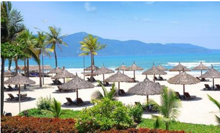
My Khe Beach (Da Nang)