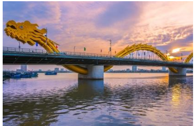
Dragon Bridge (Da Nang)