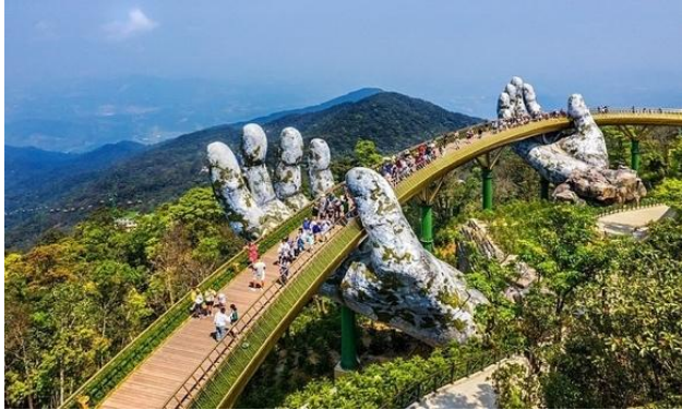
Golden Bridge (Ba Na)