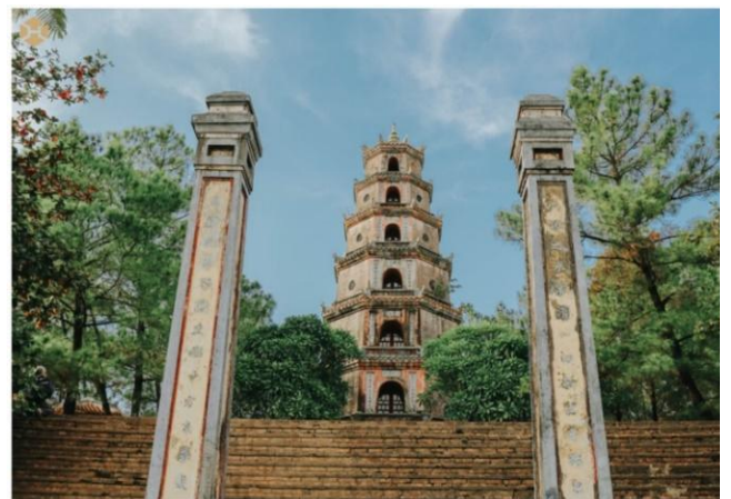
Thien Mu Pagoda (Hue)