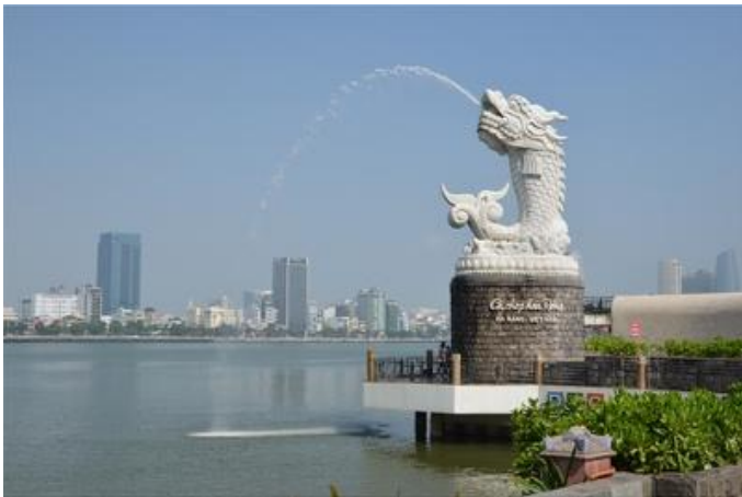
Dragon Carp Fountain (Da Nang)