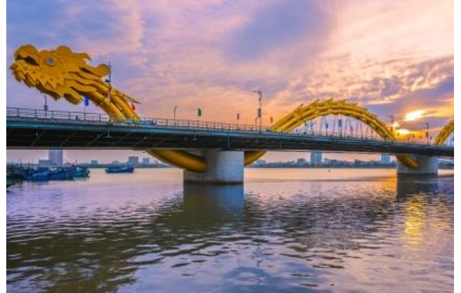
Dragon Bridge (Da Nang)