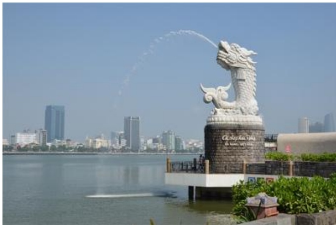
Dragon Carp Fountain (Da Nang)