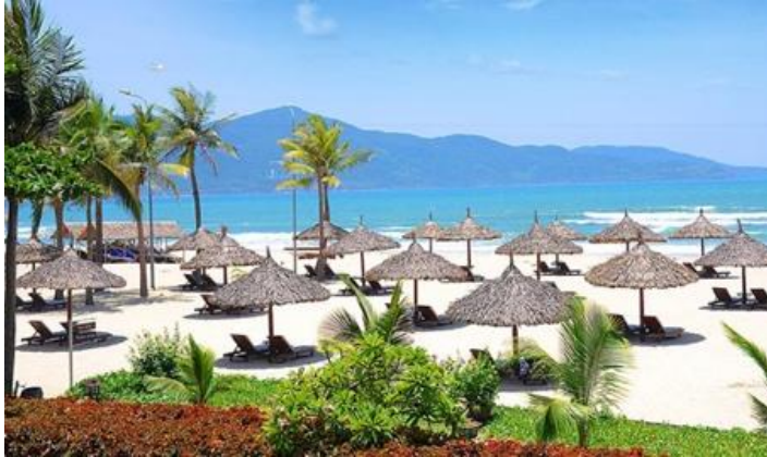
My Khe Beach (Da Nang)