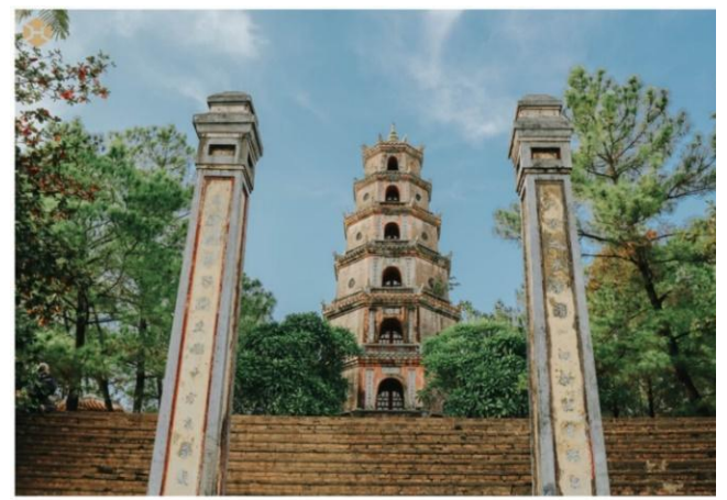
Thien Mu Pagoda (Hue)