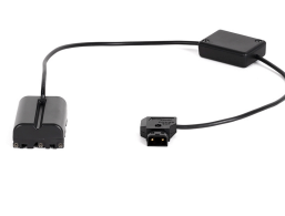
P-Tap to Sony (a77 II, a99 II, a68) Dummy Battery