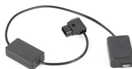
P-Tap to Sony A7s, A7r, A7sII, A7rII