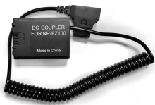
P-Tap to Sony A9, A7rIII, A7sIII (Dummy NP-FZ100)