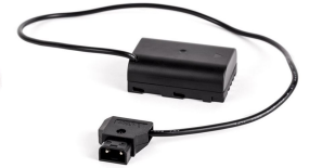
P-Tap to GH5, GH4, GH3 (20")