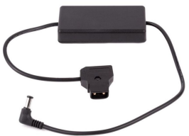
P-Tap to Sony FS7, FS5, Panasonic EVA1