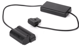
P-Tap to Nikon (D5600, DF D3300) Dummy Battery