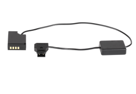
P-Tap to Fujifilm (X-H1, XT-2, XT-2, XT-3) Dummy Battery