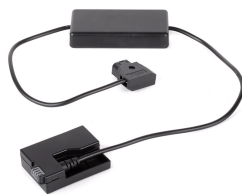
P-Tap to Canon (T5i) Dummy Battery