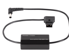
P-Tap to Sony (FX9) - 20"