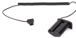
P-Tap to Canon 1DX, 1DXmkII, 1DXmkIII, 1DC (20")