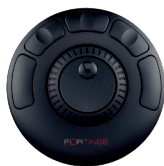
HCD Hand Control Device