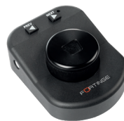
JC1 Hand Controller