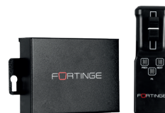
RF Kit Hand Controller