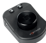
JC1 Hand Controller