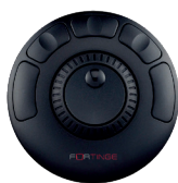
HCD Hand Control Device