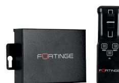
RF Kit Hand Controller