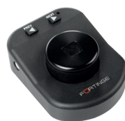
JC1 Hand Controller