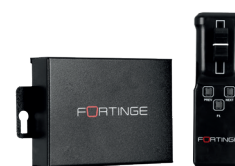
RF Kit Hand Controller