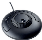
HCD Hand Control Device