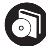
Forprompt Studio & Forprompt Studio News Software