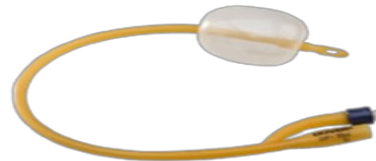
LATEX FOLEY CATHETER

Endotracheal Tube is a tube constructed of polyvinyl chloride that is placed between the vocal cords through the trachea