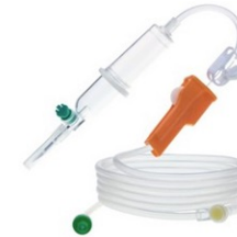
IV INFUSION SET

The 2-way Siliconized Latex Foley Catheters prolonged durability and flexibility. It contribute to increased patient comfort