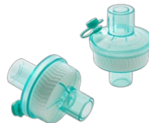
HEAT AND MOISTURE EXCHANGER

Catheter Mount is used as an intermediary connection between the patient and the breathing system. These tubes are made of a special flexible co-polymer