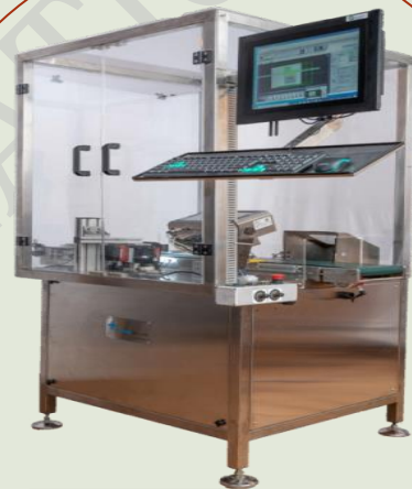
LABEL PRINTING MACHINE