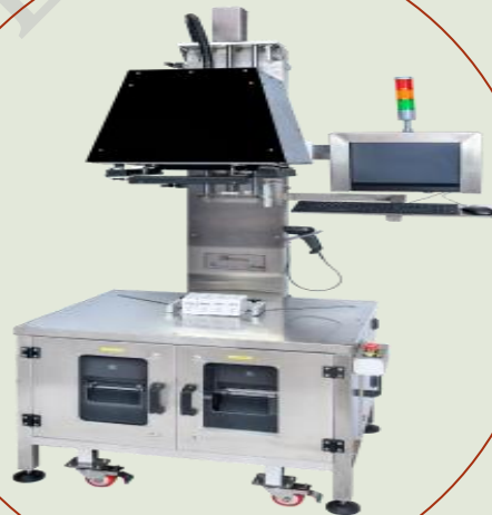
LABEL SCANNING MACHINE