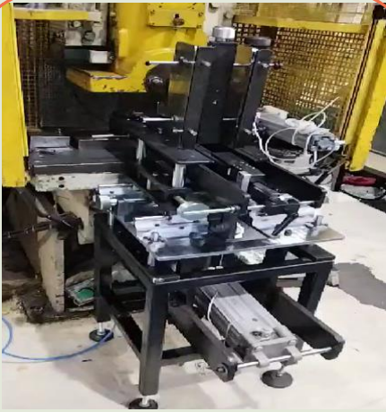
AUTO BLANK LOADING & UNLOADING