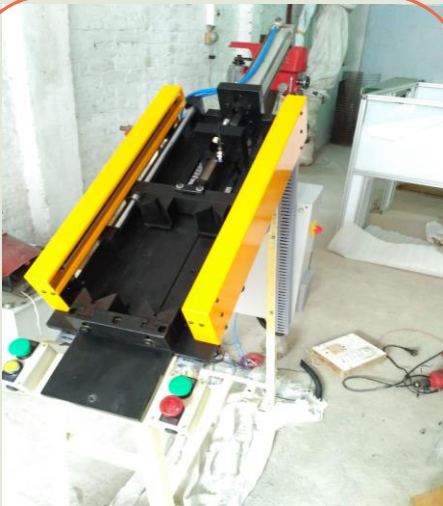
AUTO LENGTH MEASURING AND PRESSING FOR SHOCK ABSORBER