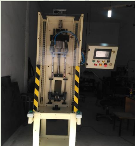
SERVO BASED PRESSING AND EXPANSION