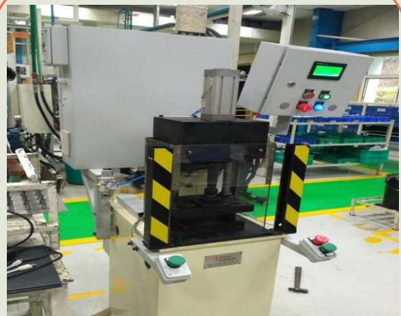
CIRCLIP INSERTING MACHINE