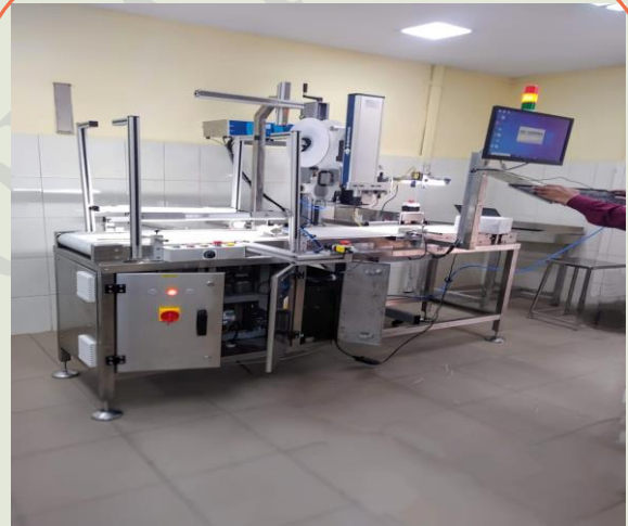
CARTON BUNDLE SCANNER WITH LABEL APPLICATOR