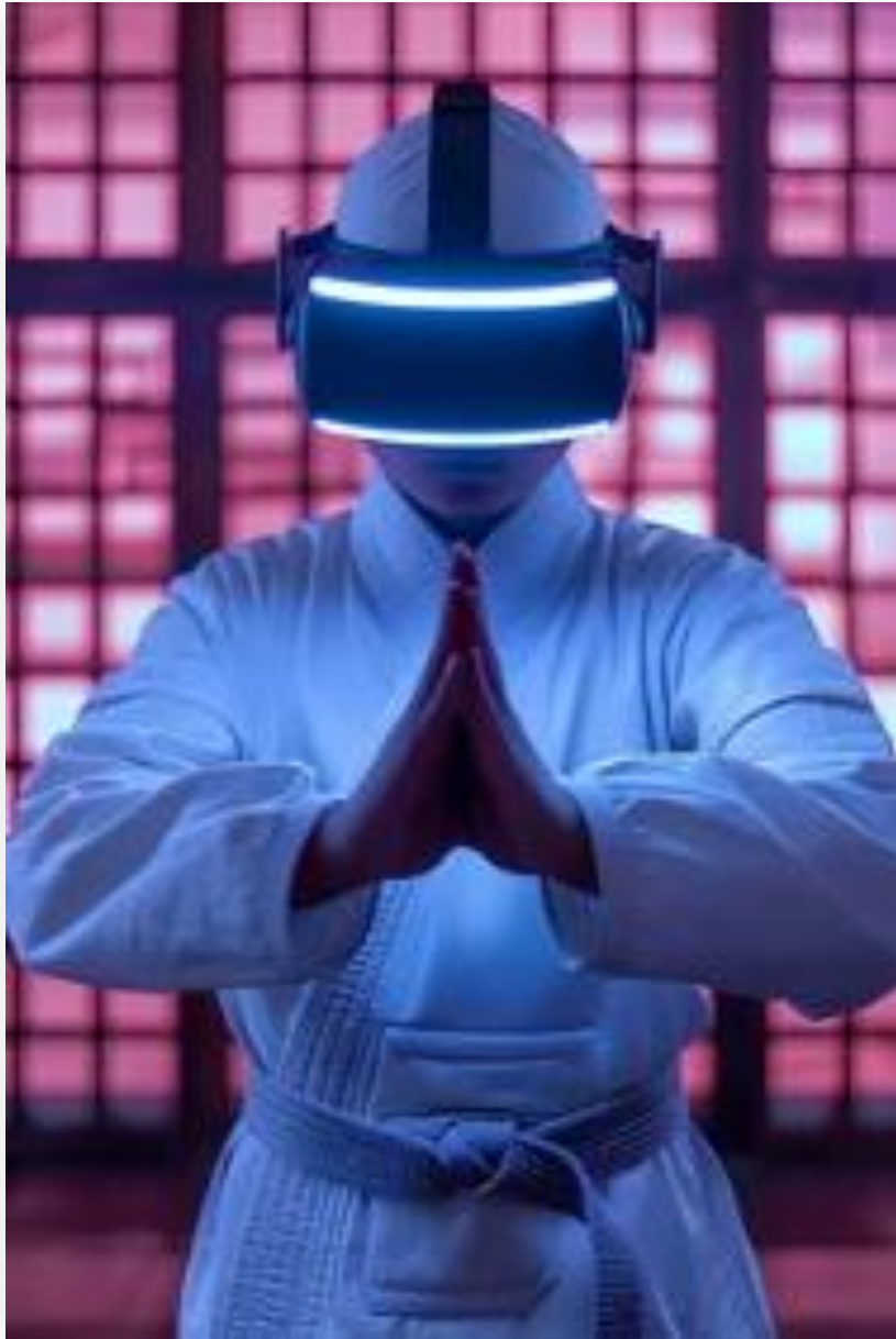
Where Human Capability Meets Intelligent Systems Design