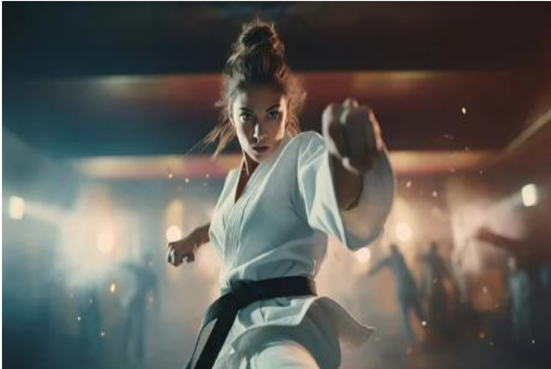
From Physical Training to Intelligent Systems Integration