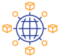
Specialty Courier & Logistics