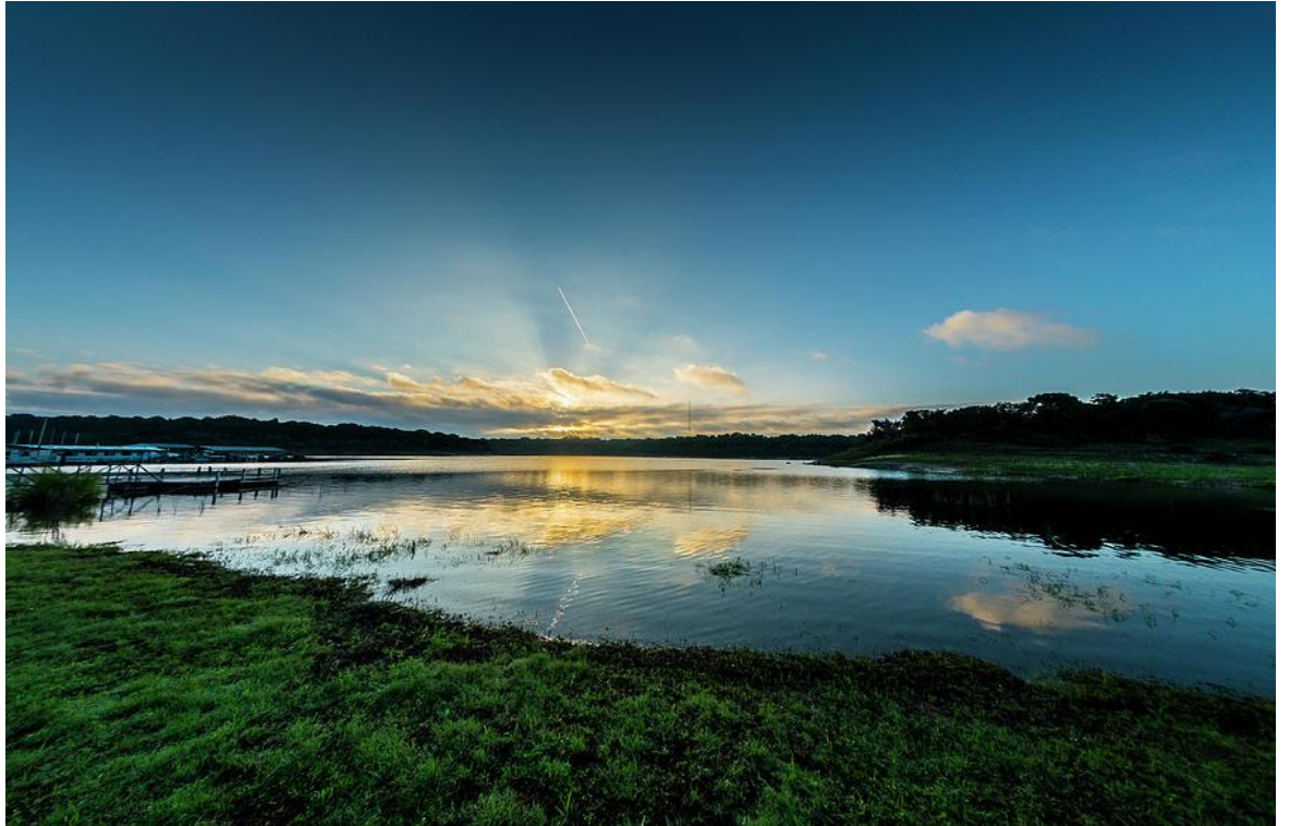
Above: Stillhouse Hollow Marina For folks that live on Lake Lewisville, this is what grass and clean water look like.