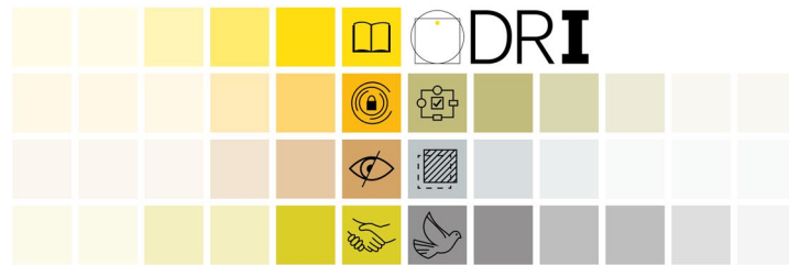
Figure 4: Symbolic Presentation of the DRI Digital Responsibility Index maturity levels (under development)