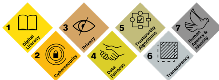
Figure 1: The seven Digital Responsibility Goals for a Sustainable Digital Economy with a focus on trusted digital solutions

Going beyond a purely "corporate perspective" as proposed by the Corporate Digital Responsibility approach [7], the DRGs provide an opportunity for various stakeholders and decision-makers from businesses, regulators, academia and civil society to form a common agenda and plan a common course of action to deal with a human-centered digital transformation. Similar to how the UN Sustainable Development Goals galvanized the international community into action and enabled an agenda for a more sustainable planet, the DRGs seek to promote digital technologies based on democratic rights and values. Developing the DRGs was started by a consortium - consisting of academics, NGOs, and industry experts – and will be further refined continuously in a multi-stakeholder approach [8]. The DRGs propose concrete measures for seven focus areas (see Fig. 1) to shape the digital economy in a way that conforms to values and is ethically sensitive [9].