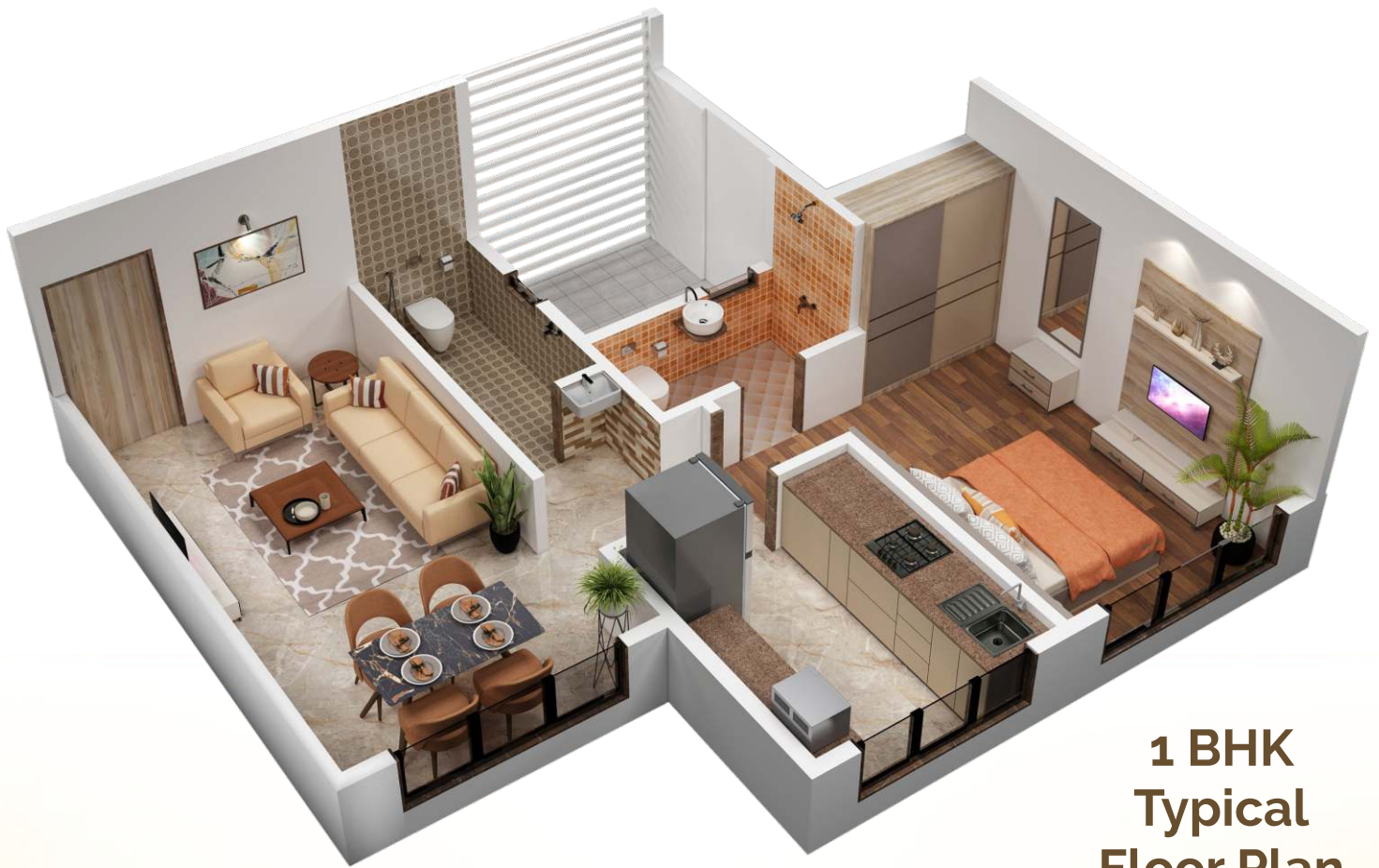
1 BHK Typical Floor Plan