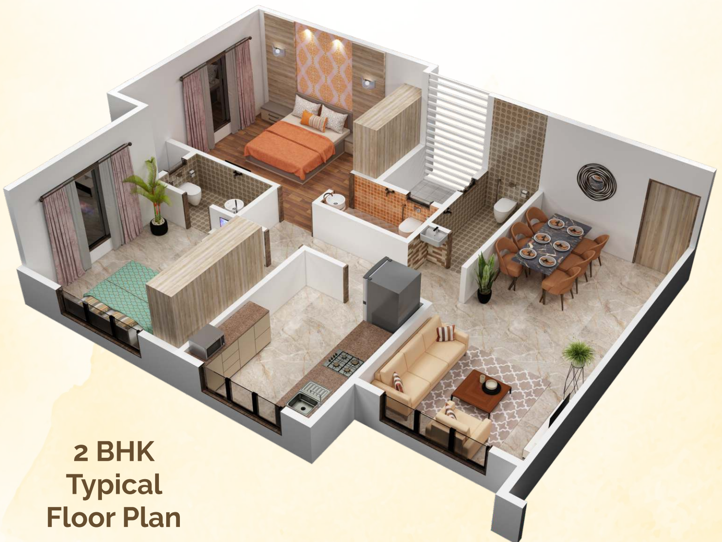
2 BHK Typical Floor Plan