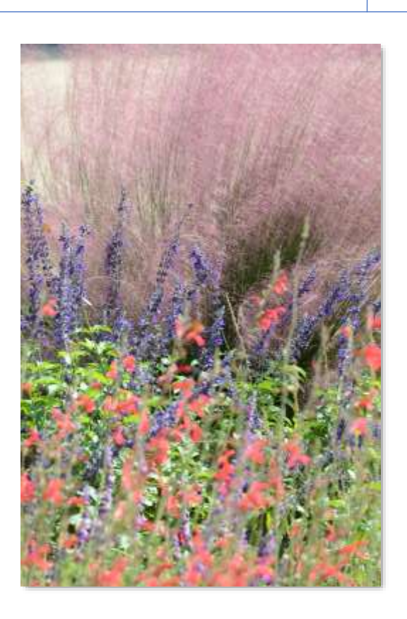
THANKS for playing! To find these plants and more information on growing them in your own garden, visit Medina Garden Nursery