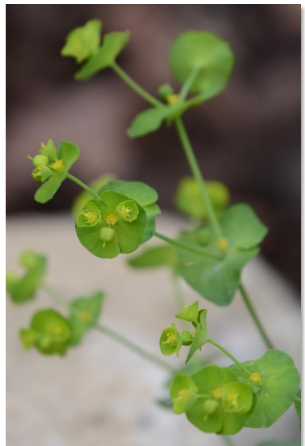
Saving the best for last : 2 nd only to pearl milkweed vine, I love Roemer's Spurge for its funny faces it seems to make – perhaps the same you'd make it you ate something this neon lemony-limey in color.