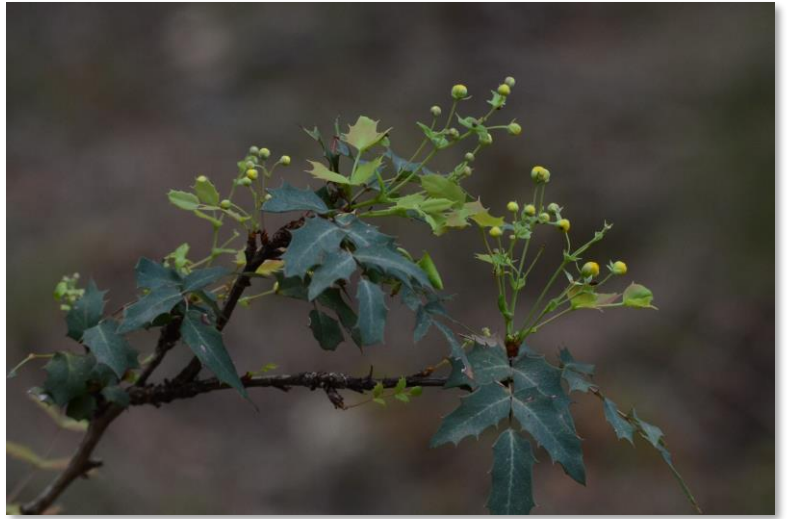
The start of this year's agarita jelly