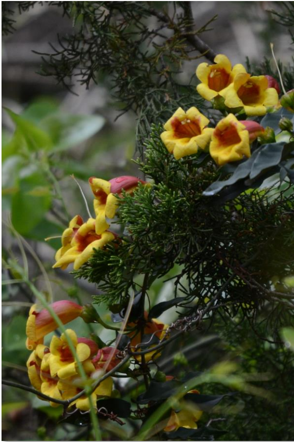
Annual crossvine plant reaching for the sky near the creek crossing by headquarters

While Busy-Birding is obviously focused on birds, it is hard not to be drawn into all of nature's beauty. This is why our motto is "Nurture Your Love for Nature."