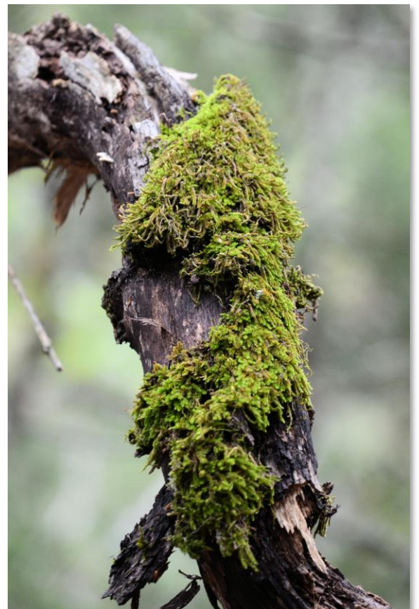
Smooth Hook Moss