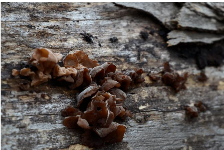
Actually, this Leafy Brain Fungus is neither plant nor animal.....it's one of the fungus among us