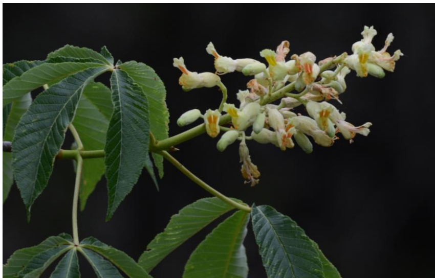
Texas Hill Country Yellow Buckeye – a local variety of Red Buckeye