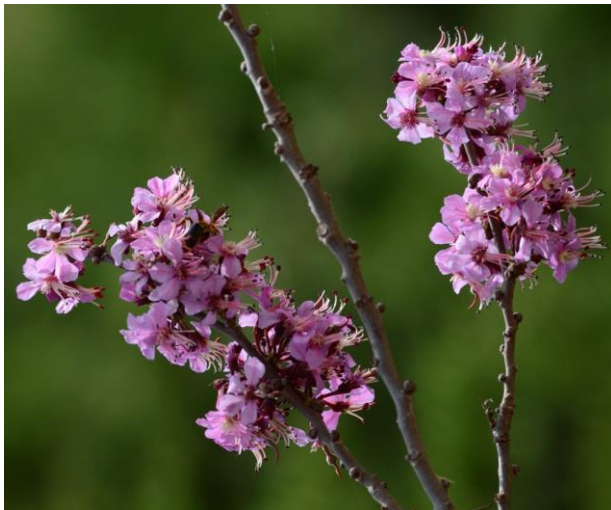
Mexican Buckeye is really a horse chestnut. Which is why botanists prefer scientific over common names...and why I am not a botanist