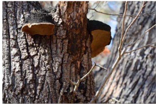
Cracked Cap Polypore Fungus