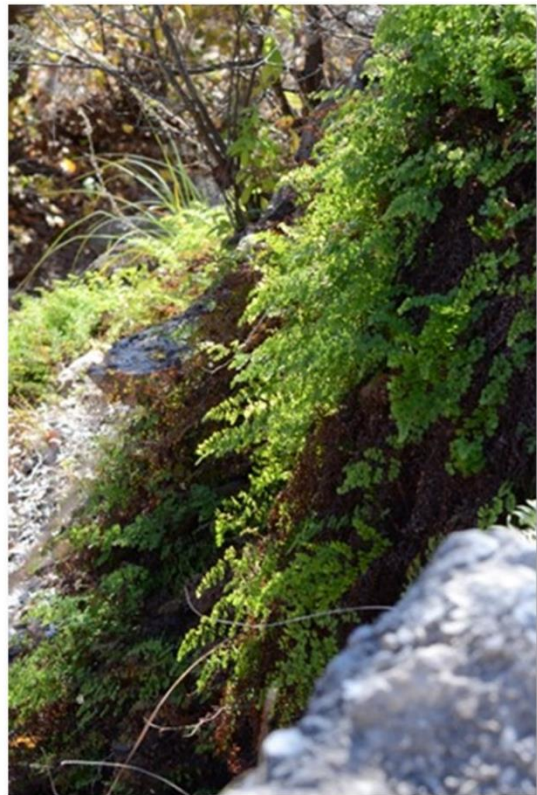
Black Maidenhair Fern