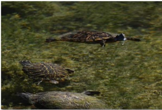
Red Eared Sliders