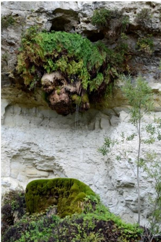
Hanging Garden this previous July