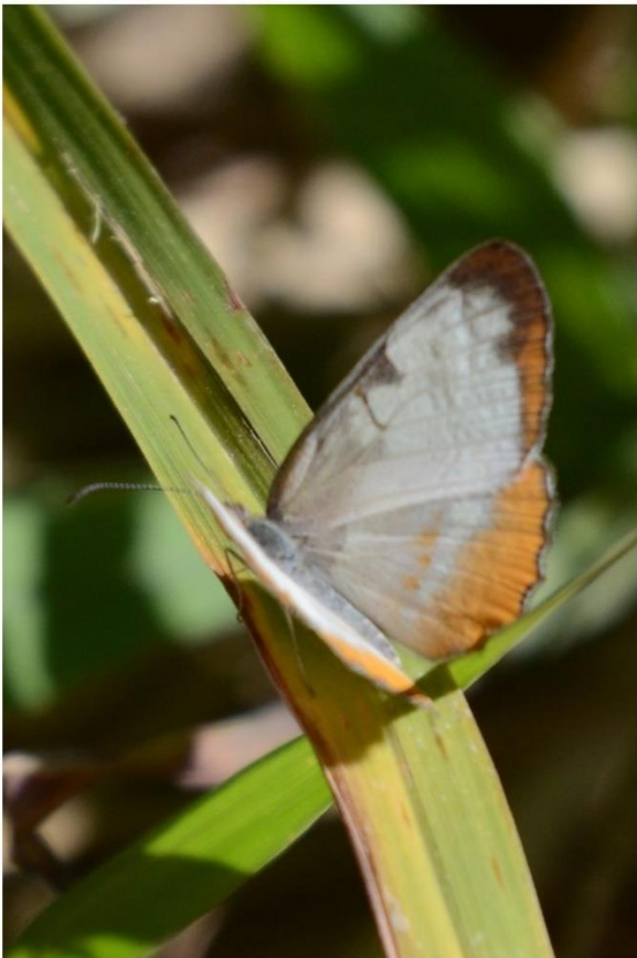
Common Maestra w/ Heart-shape