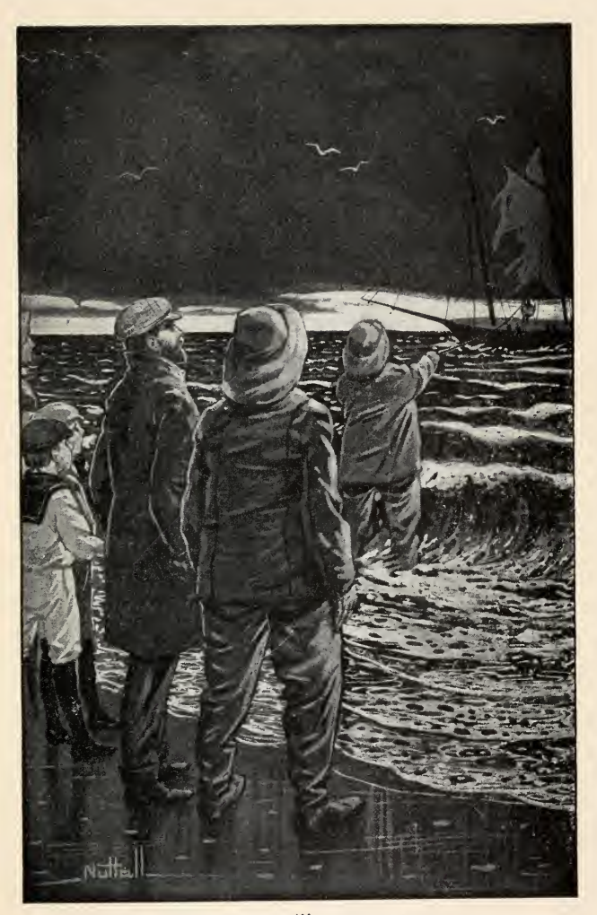
"THERE'S A MAN IN IT !" EXCLAIMED THE BOYS. The Bobbsey Twins at the Scashore. Page 192