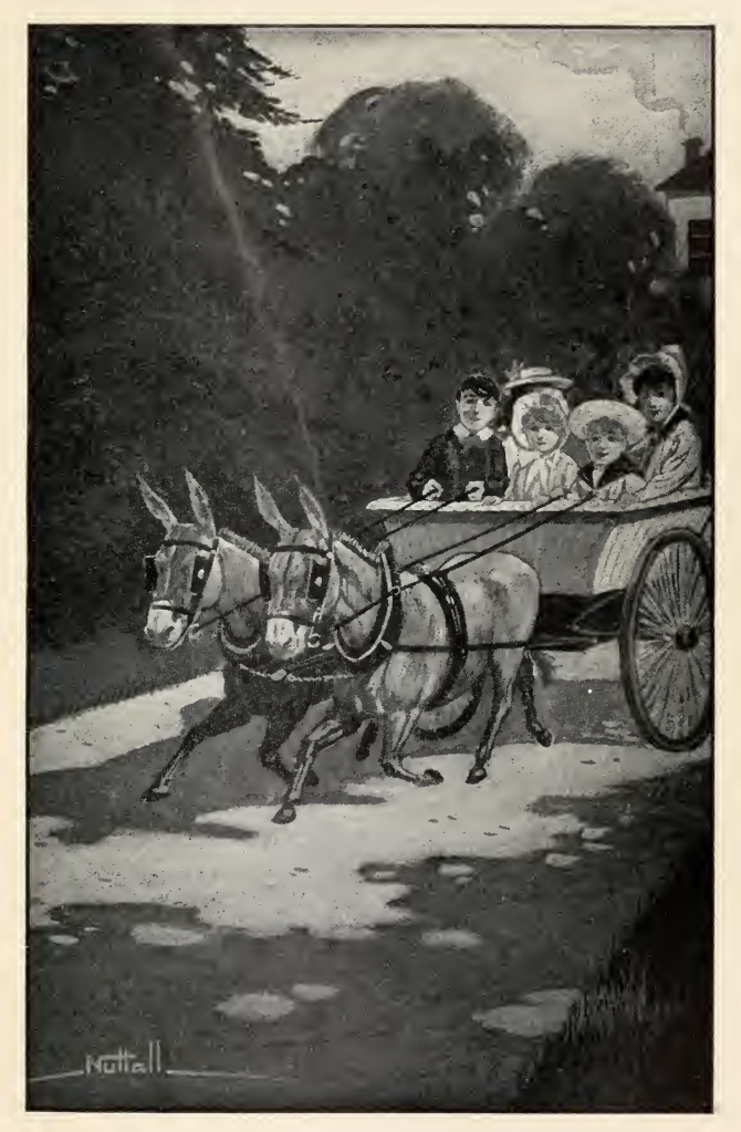
THEY RODE ALONG THE SANDY DRIVEWAY. The Bobbsey Tevins at the Scashore. Page 65