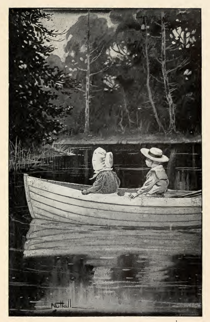
TOWARD THIS LITTLE ISLAND THE CHILDREN'S BOAT WAS NOW DRIFTING.