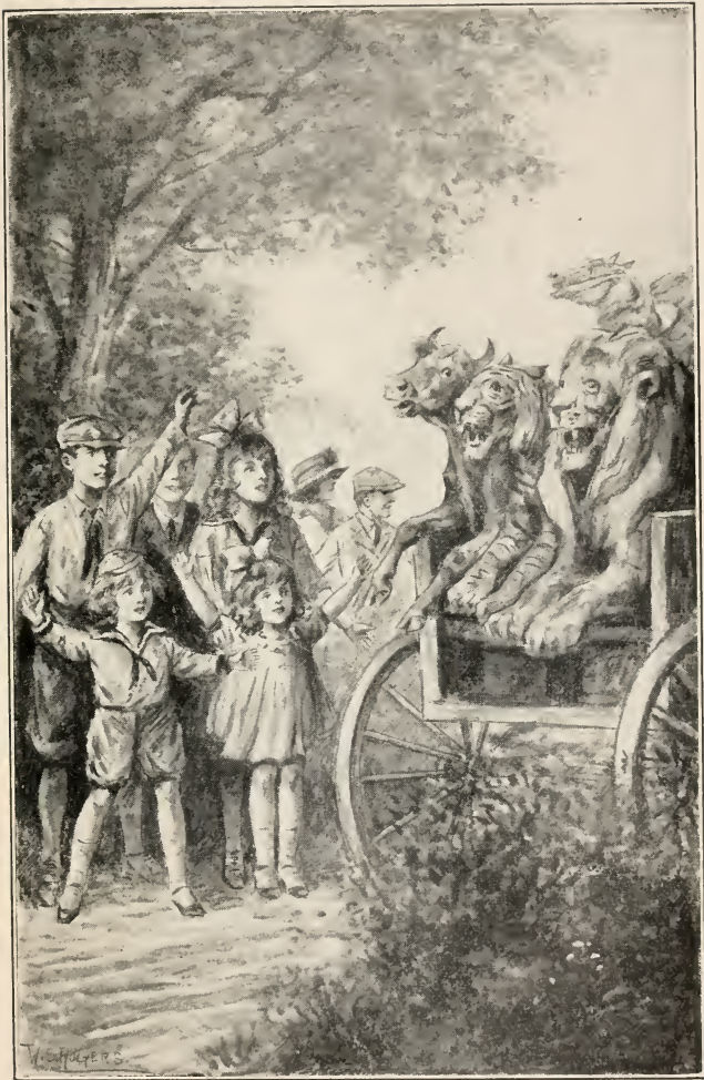
"GOOD BY!" CALLED THE BOBBSEY TWINS. The Bobbsey Twins at the County Fair. Page 45