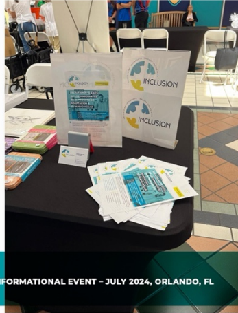
INFORMATIONAL EVENT – JULY 2024, ORLANDO, FL