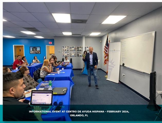
INFORMATIONAL EVENT AT CENTRO DE AYUDA HISPANA – FEBRUARY 2024, ORLANDO, FL