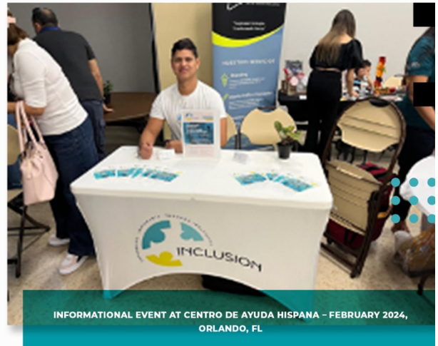
INFORMATIONAL EVENT AT CENTRO DE AYUDA HISPANA – FEBRUARY 2024, ORLANDO, FL