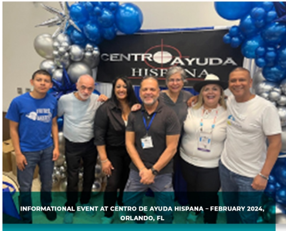
INFORMATIONAL EVENT AT CENTRO DE AYUDA HISPANA – FEBRUARY 2024, ORLANDO, FL