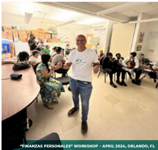
"FINANZAS PERSONALES" WORKSHOP – APRIL 2024, ORLANDO, FL