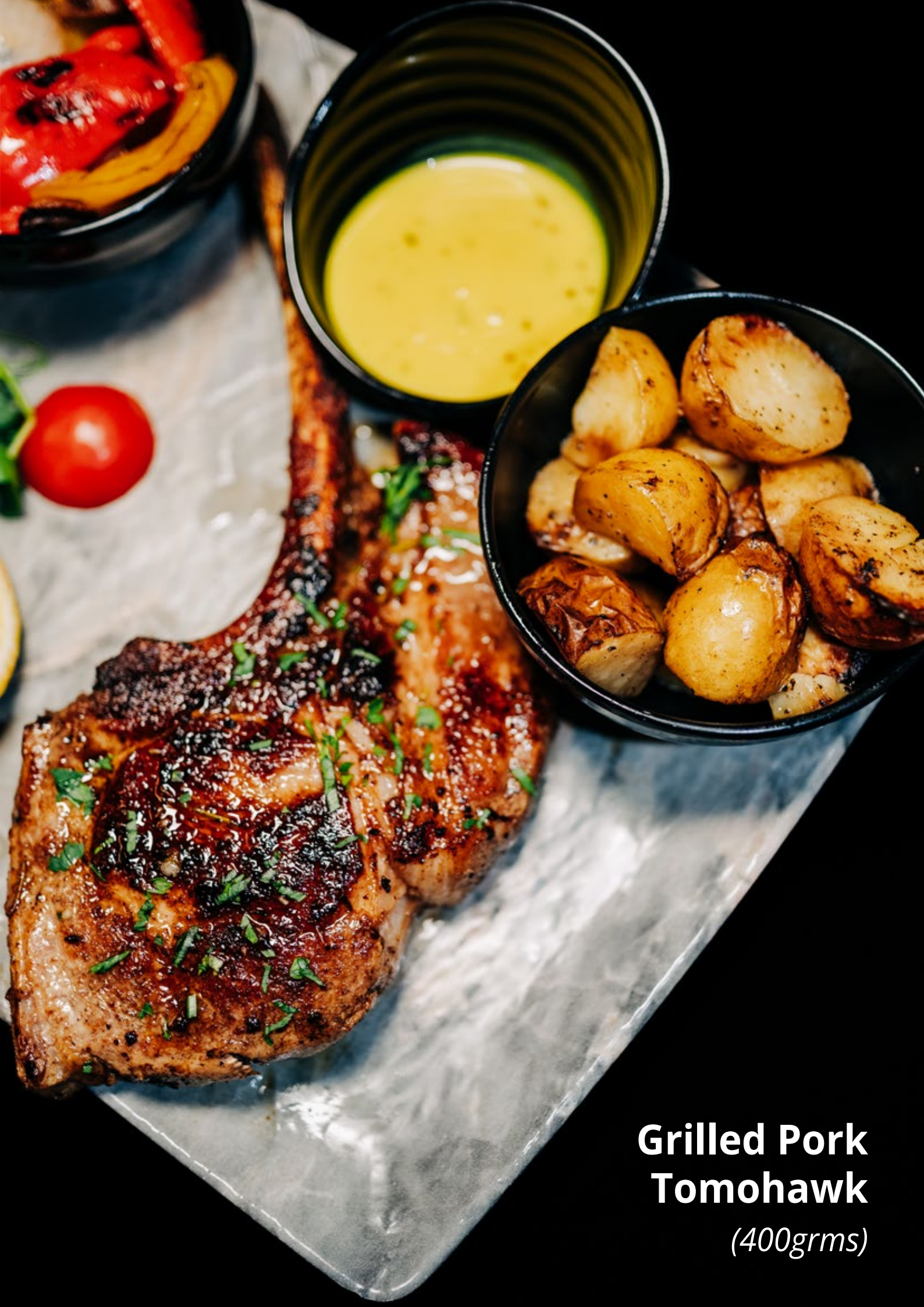
Grilled Pork Tomohawk (400grms)