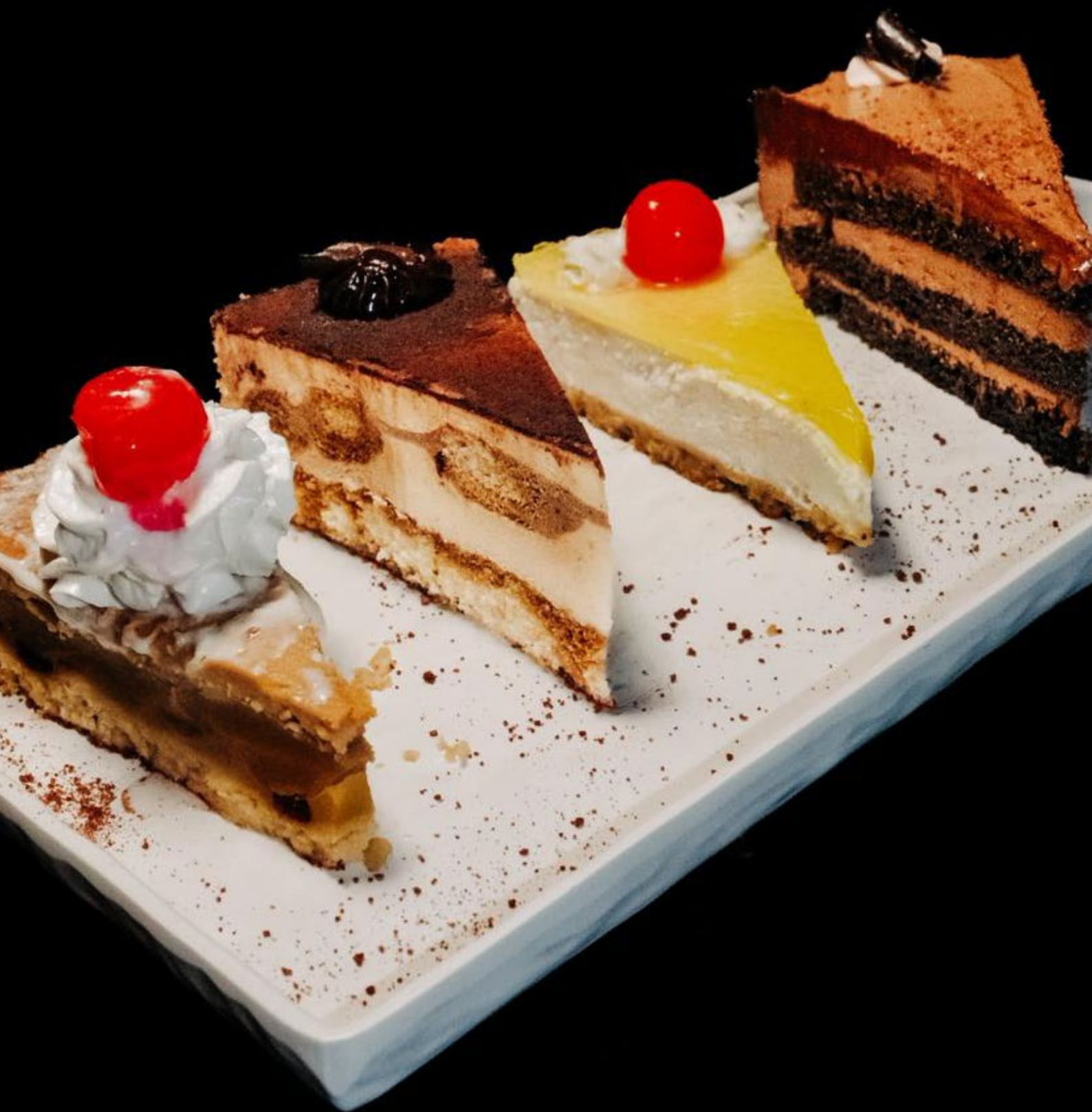
Selection of Gateau