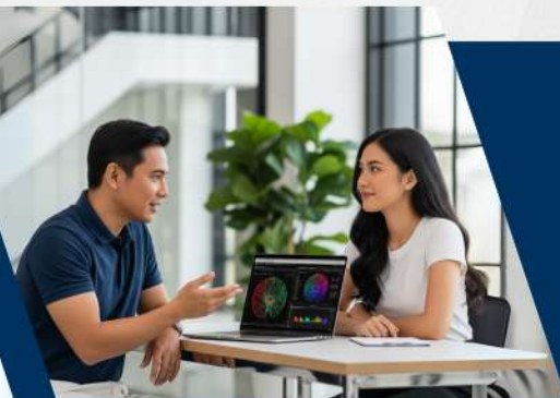
Consult with an Expert