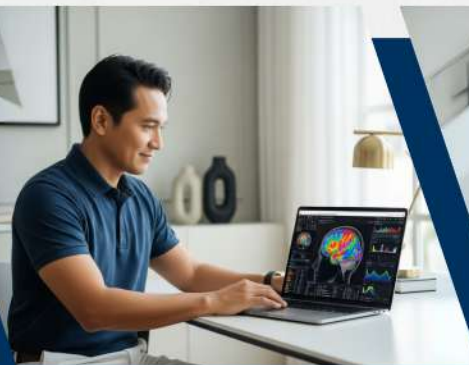
Receive Your Profiling Report