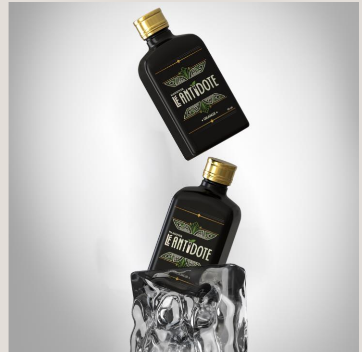
3D product visualization for Le Antidote.