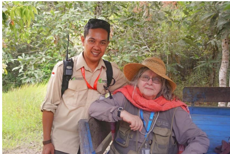
Dr. Birute Galdikas – The World's Eminent Orangutan Scientist and Founder of Camp Leakey

Experience the orangutans in their natural habitat and marvel at the diverse flora and fauna of this unique ecosystem.