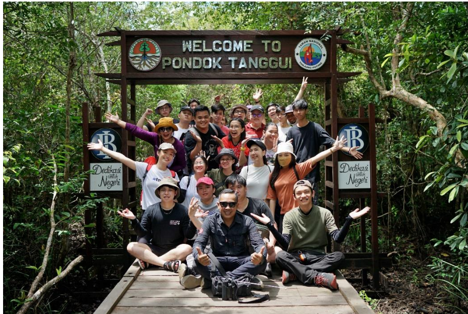
Camp Pondok Tanggui

Your guide will provide fascinating insights into the history of the orangutans you encounter, offering a glimpse into their social interactions. Keep your camera poised to capture these memorable moments.