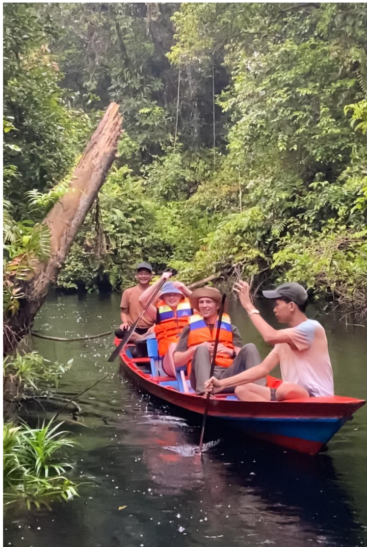
Canoeing at Sungai Buluh

approximately an hour, where the serene beauty of the rainforest unfolds around you. Immerse yourself in the tranquil surroundings and savor the morning panorama, as the lush nature reveals its stunning charm.