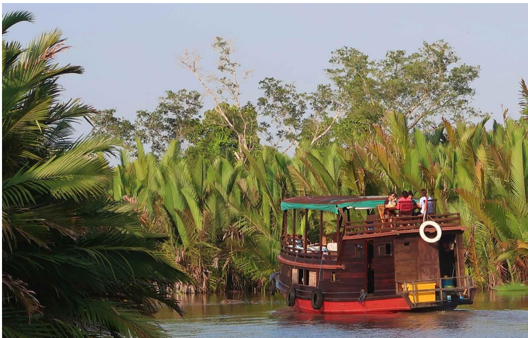
Morning river cruise back to Kumai Harbor

Your journey officially concludes, leaving you with cherished memories of a remarkable adventure.