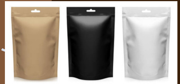
Customized packaging solutions available