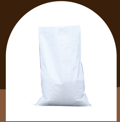
25kg Premium Grade Bags