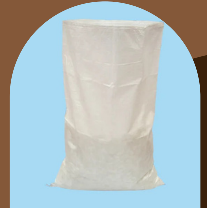
50kg Industrial Grade Bags