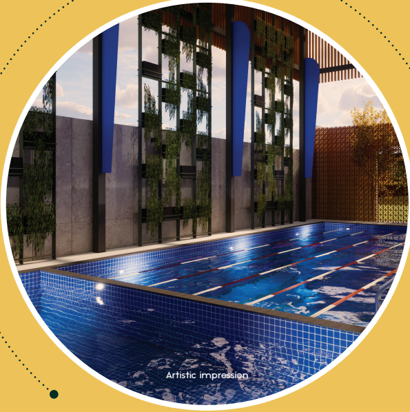
Temperature Controlled Swimming pool